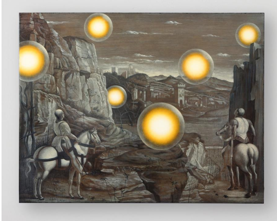
Laurent Grasso, Studies into the Past , Grisaille and oil on wood, 30 13/16 x 39 5/8 x 2 3/8 inches © Laurent Grasso / ADAGP, Paris, 2019 Courtesy: Sean Kelly, New York