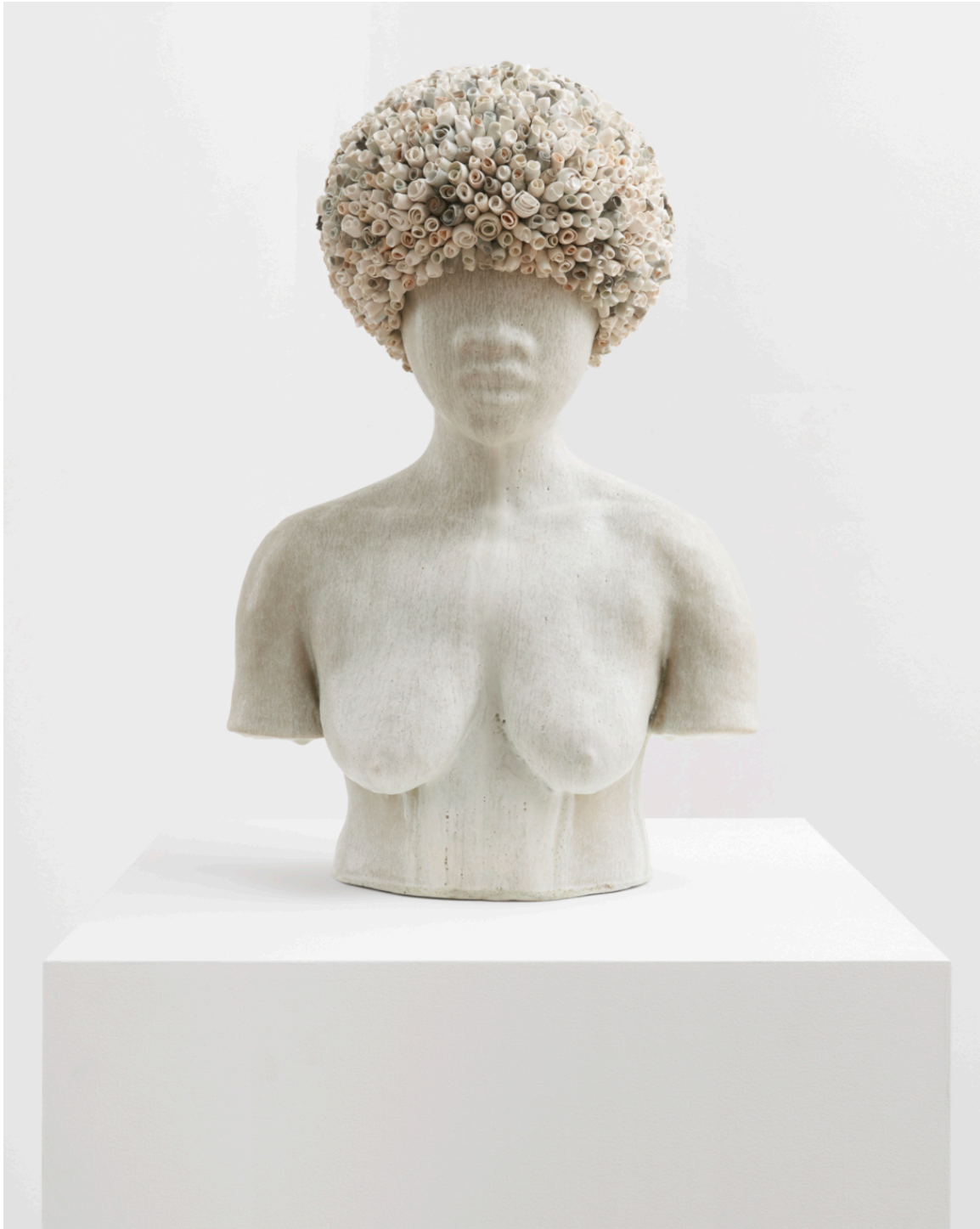
Simone Leigh, Untitled, 2021. © Simone Leigh, Courtesy Matthew Marks Gallery.