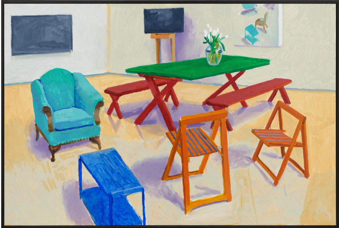
David Hockney, Studio Interior #2 (2014). © David Hockney.