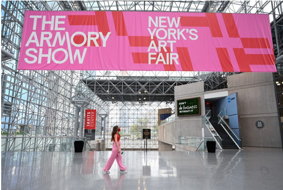
Installation view, the Armory Show 2021.