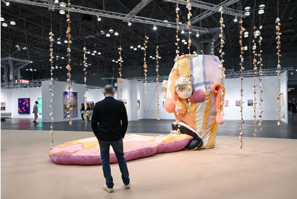
Installation view, the Armory Show.