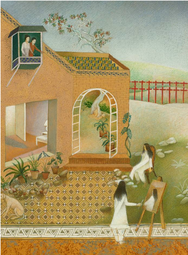
Detail from 'The Scroll' (1989-90)

“I chose the medium when it was widely considered craft, with no room allowed for creative expression, because I perceived a frontier,” she says. To her, the principles of beauty and exactitude in manuscript illustration also contained subversive potential. She saw herself as an explorer discovering new worlds in pocket-sized places.