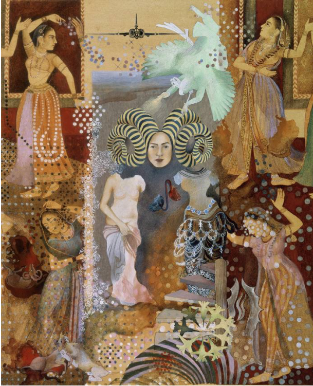
'Pleasure Pillars' (2001) by Shahzia Sikander © Courtesy: the artist, Sean Kelly, New York and Pilar Corrias, London

Shahzia Sikander opens tiny windows on to colossal vistas. Her manuscript-like paintings on paper only look modest from a distance. Up close, they unveil themselves at leisure, divulging layers of meticulously rendered hyperreality. In "Venus's Wonderland" (1995) a veiled woman emerges from the waters, an alligator has usurped her clamshell, and a monkey hanging from the Tree of Knowledge by its tail pelts her with apples. The scene, an intricate mash-up of mythological motifs, bursts past the frame, as if all that detail, energy and imagination can't be contained by artifice. Sikander allows her mind to roam even as she freezes allegory into image, movement into line. Her gorgeous exhibition at New York's Morgan Library and Museum offers keyhole glimpses into a vast, fantastical world that bears an uncomfortable resemblance to our own. Extraordinary Realities covers the first 15 years of the 51-year-old artist's career, from her formal training in Pakistan to the beginnings of her life in New York, where she still lives. When Sikander entered the National College of Arts in Lahore in 1987, Western modes dominated the academy. She opted for an alternative path, studying with Bashir Ahmad, a master of Indo-Persian miniature painting. This demanding discipline, with its gods and kings and laborious techniques, had fallen deeply out of fashion. Though her hip peers saw only