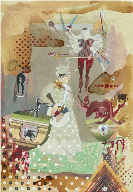
'Hoods Red Rider II' (1997) © Courtesy: the artist, Sean Kelly, New York and Pilar Corrias, London

The avatar and the veil reappear regularly throughout Sikander's work, elements in her elaborate symbolic language. The artist and the show focus attention on that idiosyncratic, cross-cultural repertoire of stories. Yet the scenes also suggest a more layered and open-ended set of narratives, and it's that interplay of specificity and allusiveness that makes these paintings so exquisite. In "Hoods Red Rider II" from 1997, Sikander conflates Little Red Riding Hood and Cinderella into a fierce and vengeful figure like the Hindu goddess Durga. The recurring silhouette is crimson now, her feet a web of shreds or contrails. A white veil shrouds her face, billowing like a superhero's cape or an angel's wings, and a dozen or more arms brandish swords, axes and daggers. At her feet, a scowling prince, rather pathetic in his pride, clutches, not a delicate slipper but a woman's clunky sandal.