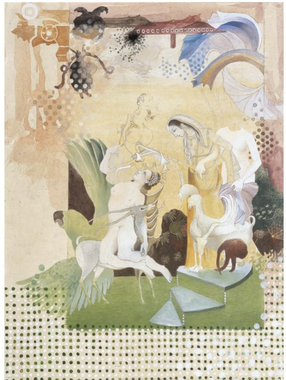
Shahzia Sikander: Intimacy, 2001