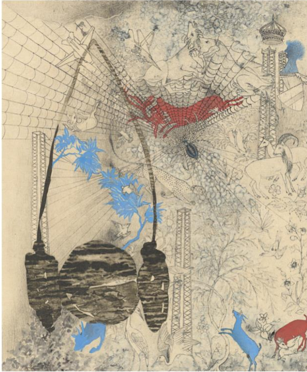
Shahzia Sikander