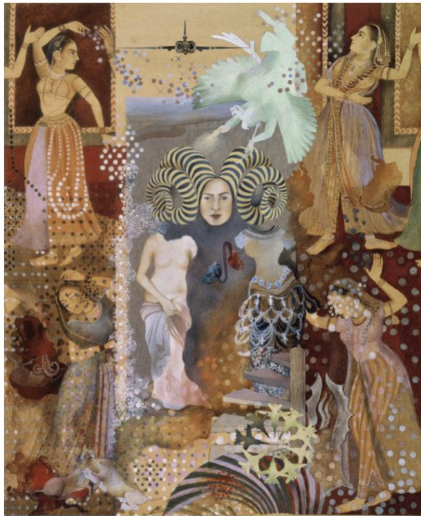
Shahzia Sikander: Pleasure Pillars, 2001