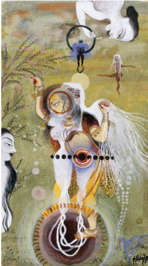
Shahzia Sikander/Sean Kelly, New York

Islamic, Jewish. After 9/11, all the client saw was the weapons in some of the goddess's hands. Pressured to alter the image, she withdrew from the project. All that remains is a gouache study, titled A Slight and Pleasing Dislocation (2001). For years that followed, she felt that her work was "glossed over and straitjacketed" by crass assumptions about her identity; as a consequence, she stepped back from the commercial gallery world.