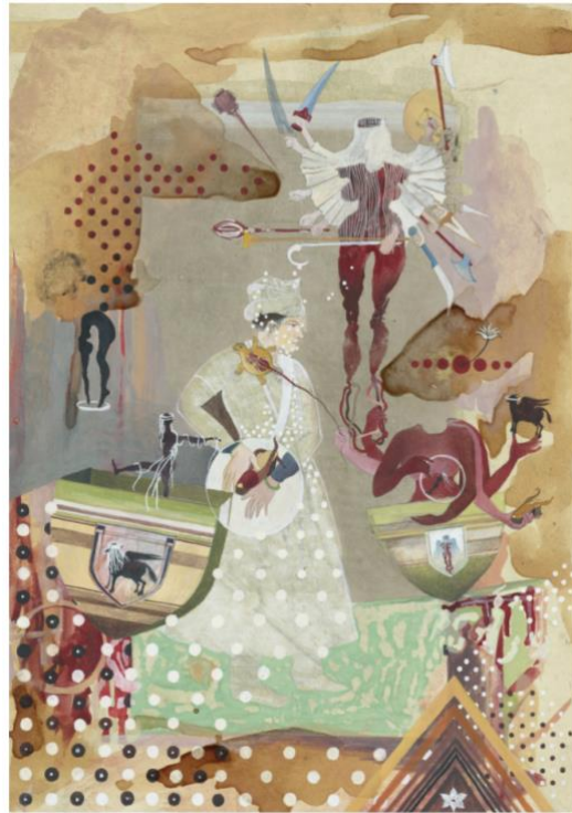
Shahzia Sikander/Sean Kelly, New York