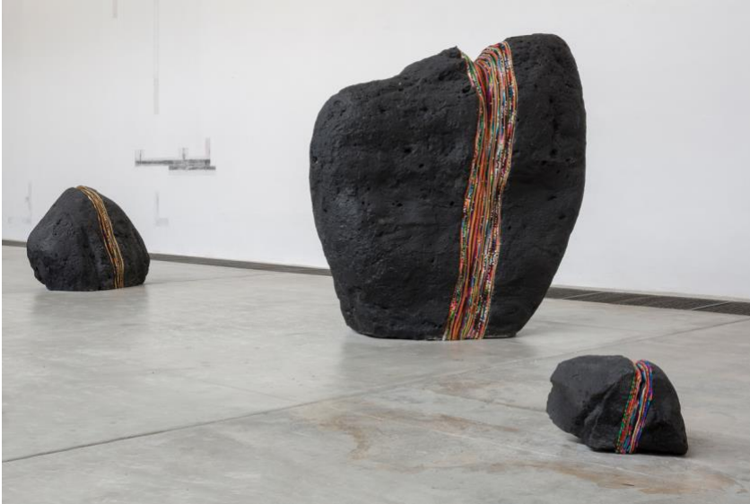
For Así comienza una montaña (2019), shown at the 2019 Venice Biennale, Cynthia Gutiérrez has embedded textiles in volcanic rocks.