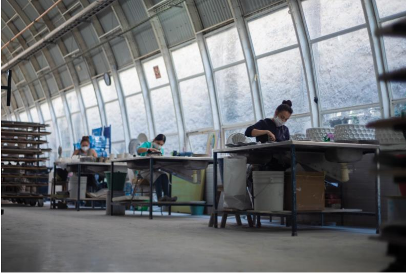
Guadalajara's Cerámica Suro is one of the world's most sought-after ateliers.