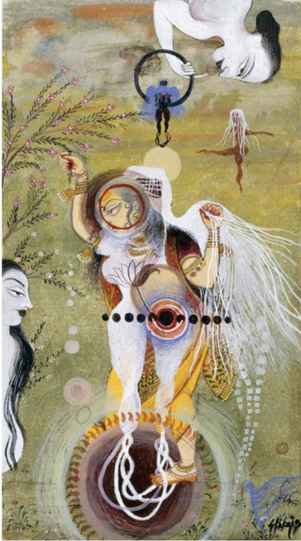
Uprooted Order, Series 3, No.1, 1997, vegetable color, dry pigment, watercolor, and tea on wasli paper. (Museum of Fine Arts, Houston, gift of Joseph Havel and Lisa Ludwig, © Shahzia Sikander. Courtesy the artist and Sean Kelly, New York)

it into a contemporary idiom,” Sikander says. “And now miniature painting has become a bigger thing.”