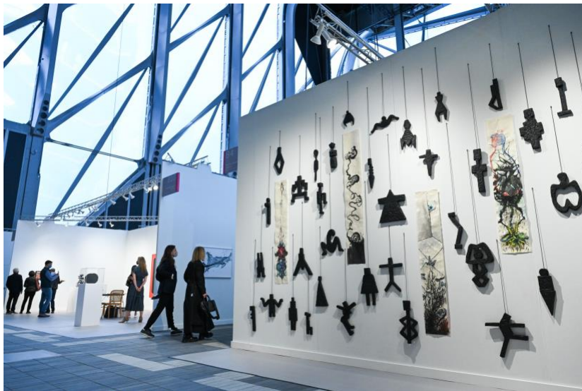
Frieze New York 2021 at The Shed