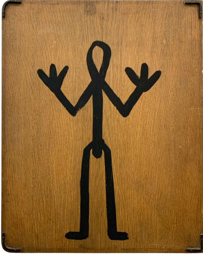
A.R. Penck, "Standart" (1967)