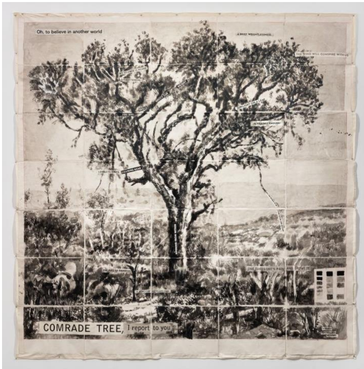
William Kentridge, Drawing from Waiting for Sibyl (Comrade Tree, I report to you), (2020)

EXHIBITORS PRAISED FRIEZE FOR SEAMLESSNESS OF INSTALL AND TIMED ENTRY GAVE GALLERIES AND GUESTS MORE TIME THAN USUAL FOR ART CHAT, MAKING DEALS AND CATCHING UP