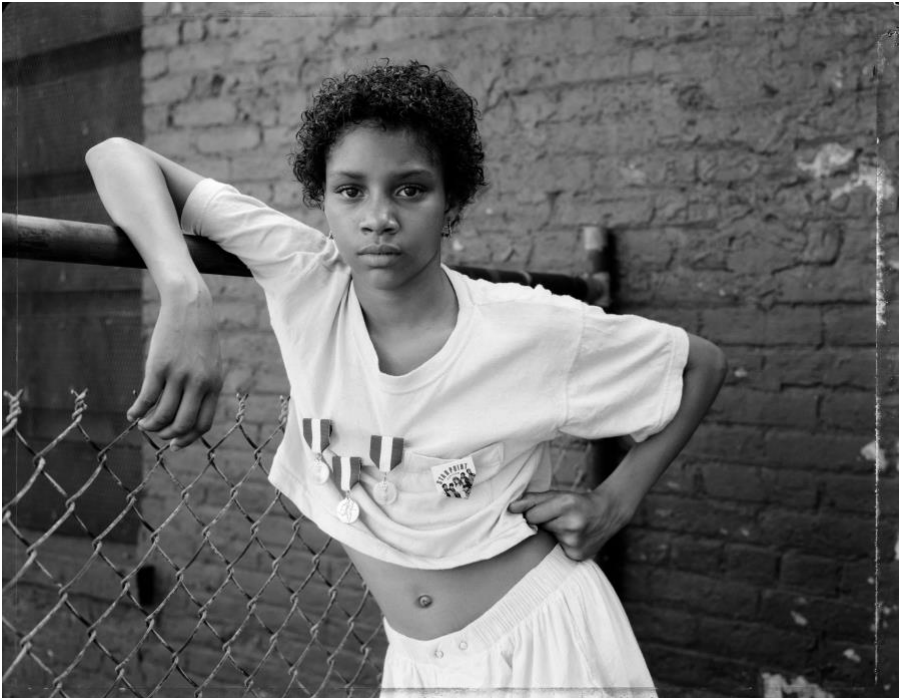
Dawoud Bey A Girl with School Medals, 1988