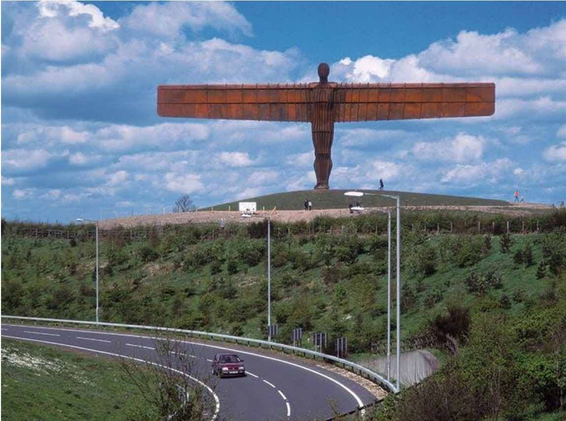
Angel of the North (1998), Antony Gormley; installed in Gateshead, Tyne and Wear.

This sense of the Angel, as deeply rooted in its particular environment, goes some way to explaining the somewhat unusual move that Gormley recently took – and which was reported in the national press – of making multiple written submissions to Highways England objecting to planned upgrades to the A1 south of Gateshead which, he contended, would mar views of the sculpture. And he's not alone – in March the Twentieth Century Society submitted an application to Historic England to list the Angel, describing it 'as an icon not only of the North East, but of the UK as a whole'. The listing was rejected but the saga suggests that Gormley and his sculptures have become objects of public debate, discussed far more widely than almost any other contemporary artist or their output. See also the fact that, when a resident of the English seaside town of Aldeburgh installed a group of Gormley's more abstract cast-iron sculptures on the beach earlier this year, complaints that they looked like 'sex toys' were eagerly reported in the newspapers. (In a further twist, the artist has objected to the owner of the works placing them on the beach when they are meant 'to stand upright'.)