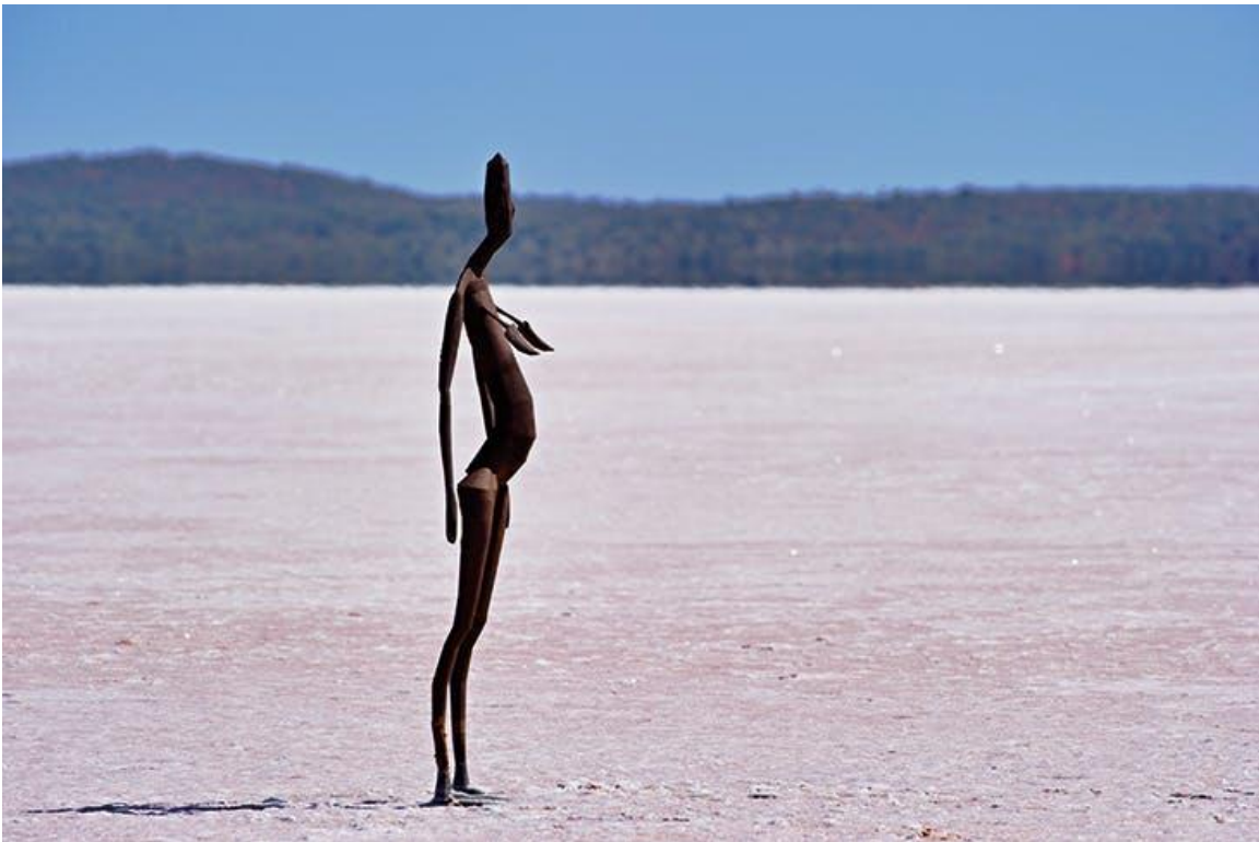
Inside Australia (2003), Antony Gormley (pictured is one of 51 sculptures installed in Lake Ballard, Western Australia in 2003).

What better moment, then, to speak to a person who has – with his scattered crowd of bodies that dot the globe from cities to seashores, from the Austrian Alps to a salt lake in Western Australia – made a career out of the idea that art is not just something you find in a gallery, that in fact it might be all the more powerful when taken out of its usual context, and placed in the world at large?