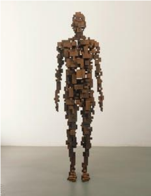
Quarters I (2005), Antony Gormley.

That is not to say that Gormley hasn't had his fair share of conventional art-world action. From his first solo exhibition at the Whitechapel Gallery in 1981, and especially after his Turner Prize win in 1994, Gormley has never been short of important commissions and surveys – most recently an exhibition at the Royal Academy in London, which highlighted the somewhat overlooked range of Gormley's work: his early casts of everyday items such as bread and apples (and, ironically enough, in a work titled Natural Selection [1981], a sex toy); his drawings; and more recent room-scale installations such as Clearing VII (2019), made up of tangled coils of aluminium tubing which the viewer is invited to walk through. There were plenty of bodies, too – ranging from rusty-red men cast from moulds of the artist's own naked body, as in Lost Horizon I (2008), to his more abstracted figures built from cubes or bars of metal. The show closed just weeks before the first national lockdown of 2020. But during our conversation, some 12 months later, there is a sense that Gormley has found the past year clarifying in terms of what art can do – and why attitudes towards art (and where we see it) may now be changing.