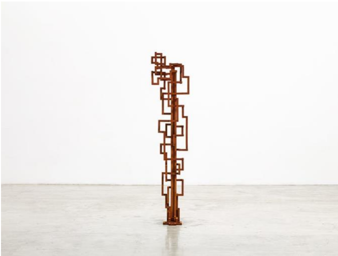
Arrest (2019), Antony Gormley.

'silver linings' of our current predicament. 'We notice and care for our environment in a very different way – we're not just passing through it; we're dwelling in it.' Gormley has been a committed advocate for climate action for many years and has repeatedly called for the art industry to reduce its carbon footprint. He has also spoken about the ways he hopes his own work – with its themes of body and place – might engender an increased awareness within individuals of our 'connection to and dependence on the context in which we find ourselves'. He is currently working on a series of sculptures titled Cast Liners , begun in 2019 and made up of networks of thin cast-iron beams, which he describes as 'diagnostic diagrams of being in the body', 'tangled things' that express 'how complex the intrarelationships of the biosphere are'.