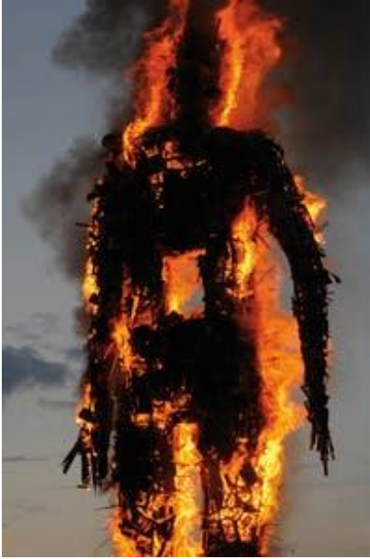
Waste Man (2006), Antony Gormley; installed in Margate in 2006. Photo: Thierry Bal; © the artist

For Gormley, all art is inherently political regardless of its content. ‘Certainly for me sculpture is a tacit act of hope because it says something like, “I don’t want to make a picture of the world, I want to change the world, I want to change the world by putting something that wasn’t there before in it, and the world then has to in some way accommodate this thing that often is a bit of an irritation or a confrontation”.’ This is not to suggest that all artworks are meant to last forever: ‘Well, I think if they are any good, they should become part of a place and if they’re not they’ll disappear.’ Some, it’s worth noting, are by their very nature ephemeral: in 2006, as part of a one-day arts festival in Margate, Gormley burnt to the ground a 25-metre-high sculpture titled Waste Man and built entirely from waste materials.