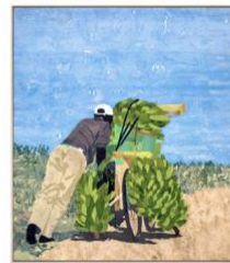
Hugo McCloud, come and go, 2020 single use plastic mounted on panel painting; 70 x 60 inches (177.8 x 152.4 cm), framed: 71 1/2 x 61 1/2 x 2 1/8 inches (181.6 x 156.2 x 5.4 cm), signed and dated by the artist, verso.