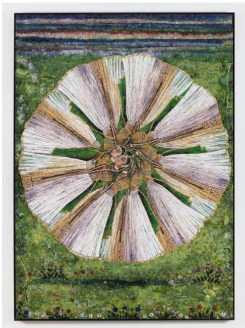
SHAHZIA SIKANDER, AROSE, 2020, GLASS MOSAIC WITH PATINATED BRASS FRAME, 84 X 62". © SHAHZIA SIKANDER.