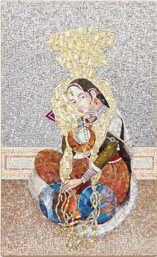
SHAHZIA SIKANDER, THE PERENNIAL GAZE , 2018, GLASS MOSAIC MOUNTED ON PLYWOOD IN BRASS FRAME, 70 1/4 X 43 1/4". © SHAHZIA SIKANDER. PHOTO: JASON WYCHE. COURTESY OF SEAN KELLY, NEW YORK.