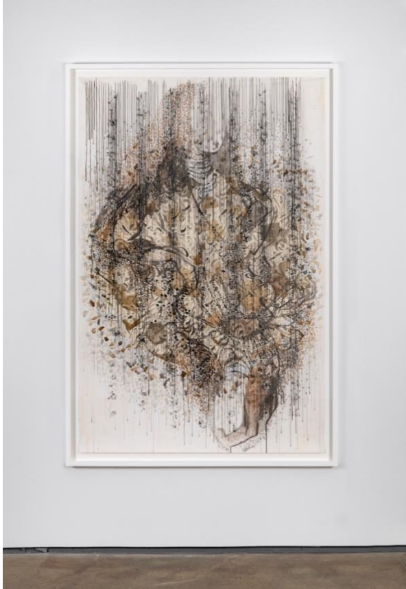
SHAHZIA SIKANDER, MIRRORED, 2019, INK AND GOUACHE ON PAPER, 85 X 51".