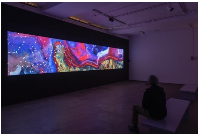
INSTALLATION VIEW OF "SHAHZIA SIKANDER: WEeping WILLOWS, LIQUID TONGUES " AT SEAN KELLY, NEW YORK, NOVEMBER 5–DECEMBER 19, 2020.