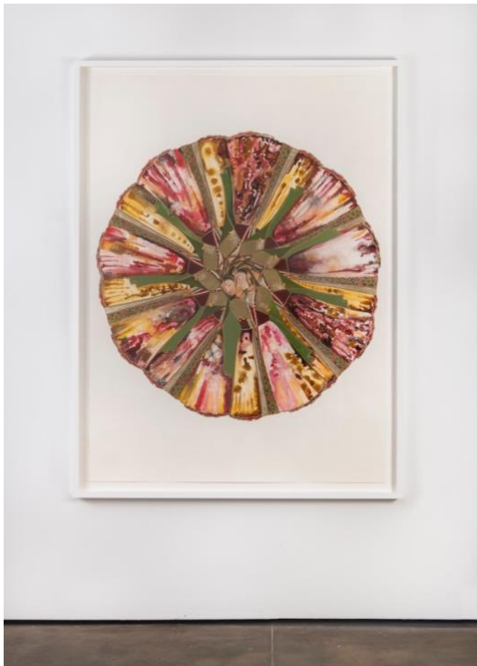
SHAHZIA SIKANDER, AROSE, 2019–2020, INK AND GOUACHE ON PAPER, 76 X 51".