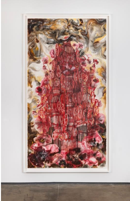
SHAHZIA SIKANDER, OIL AND POPPIES, 2019–2020, INK AND GOUACHE ON PAPER, 98 X 51".