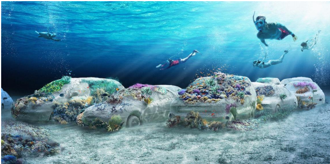
Rendering of Leandro Erlich’s Concrete Coral for The Reef Line © Leandro Erlich Studio

The new commission will create space for the formation of natural coral reefs, which have been in decline worldwide but have faced significant disintegration in Miami Beach in the past decade. The piece aims to have the “beauty of not just being an amazing artwork but also a sculptural reef serving a specific environmental function”, Caminos says.