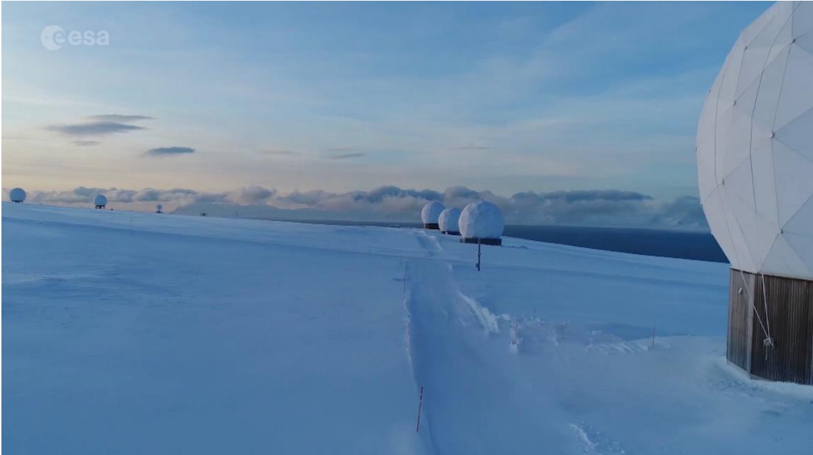
Laurent Grasso. Work in progress (screenshots of a film project)