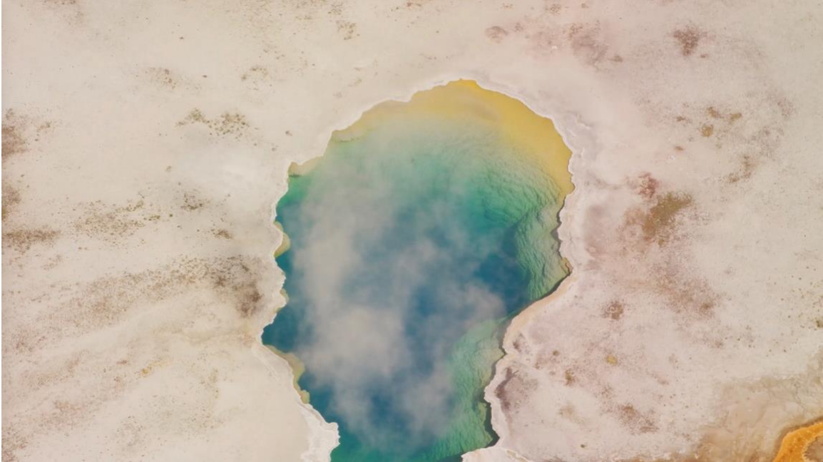
Laurent Grasso. Simulation of the installation of a LED screen in the nave of the Musée d'Orsay / Photo: Studio Laurent Grasso / Courtesy of the artist and Perrotin / © Laurent Grasso / ADAGP, Paris 2020