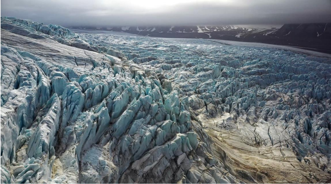
Laurent Grasso. Work in progress (screenshots of a film project) / Photo: Studio Laurent Grasso / Courtesy of the artist and Perrotin / © Laurent Grasso / ADAGP, Paris 2020