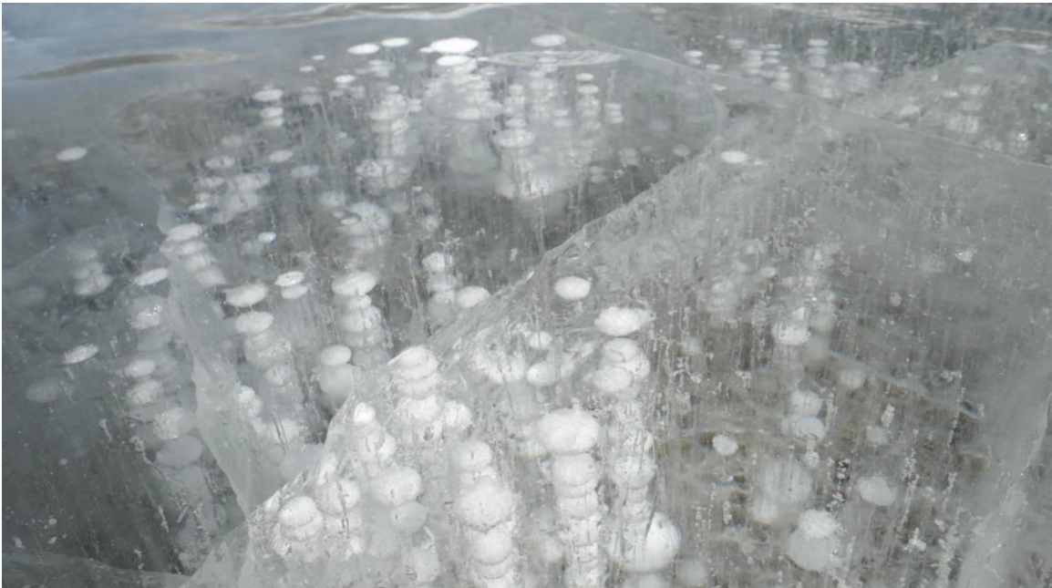
Laurent Grasso. Work in progress (screenshots of a film project) / Photo: Studio Laurent Grasso / Courtesy of the artist and Perrotin / © Laurent Grasso / ADAGP, Paris 2020