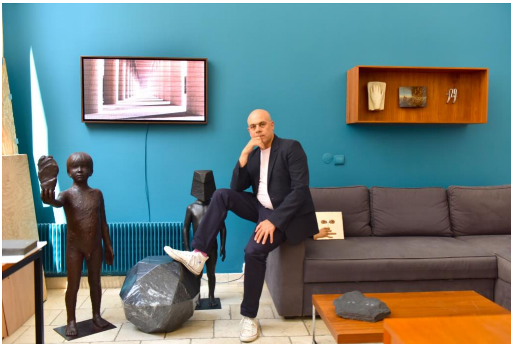
Laurent Grasso.

Laurent Grasso. Work in progress and research on mutated flowers