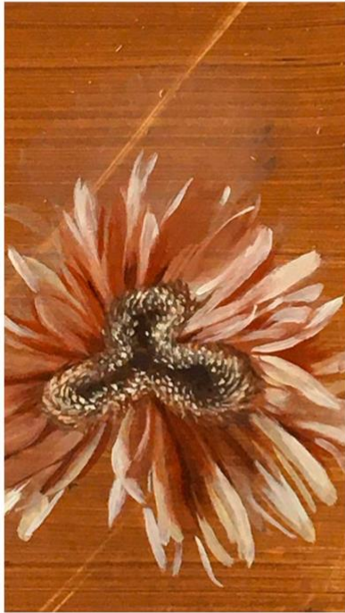
Peinture en cours (détail)