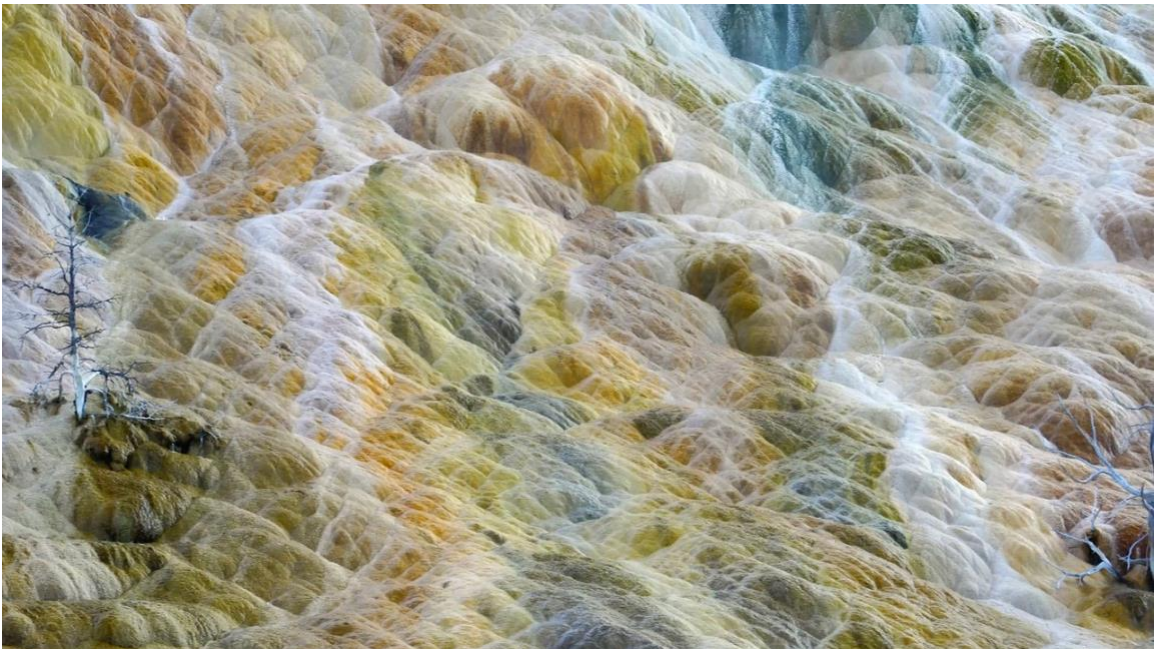
Laurent Grasso. Work in progress (screenshots of a film project) / Photo: Studio Laurent Grasso / Courtesy of the artist and Perrotin / © Laurent Grasso / ADAGP, Paris 2020