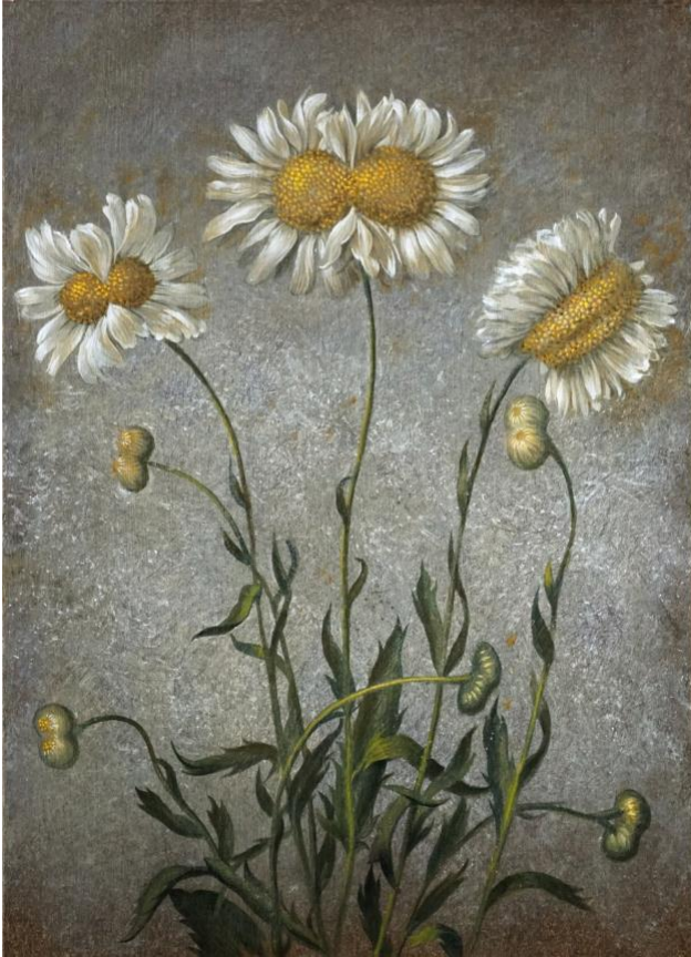
Laurent Grasso. Untitled. 2020. Oil on wood, 33 x 24 cm / Photo: Studio Laurent Grasso / Courtesy of the artist and Perrotin / © Laurent Grasso / ADAGP, Paris 2020