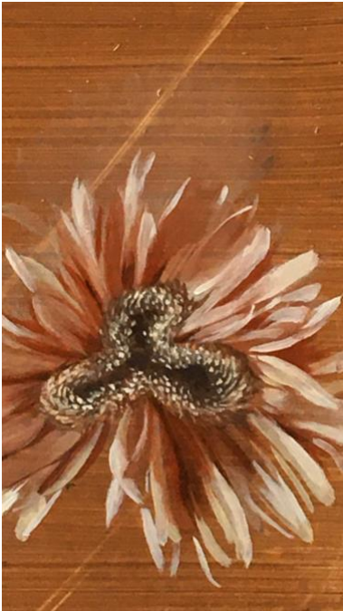
Laurent Grasso. Untitled. 2020. Oil on wood, 33 x 24 cm / Photo: Studio Laurent Grasso / Courtesy of the artist and Perrotin / © Laurent Grasso / ADAGP, Paris 2020