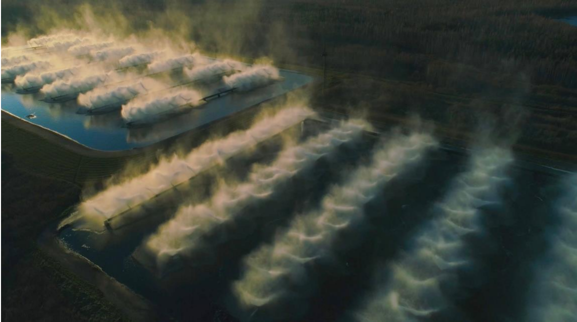
Laurent Grasso. Work in progress (screenshots of a film project) / Photo: Studio Laurent Grasso / Courtesy of the artist and Perrotin / © Laurent Grasso / ADAGP, Paris 2020