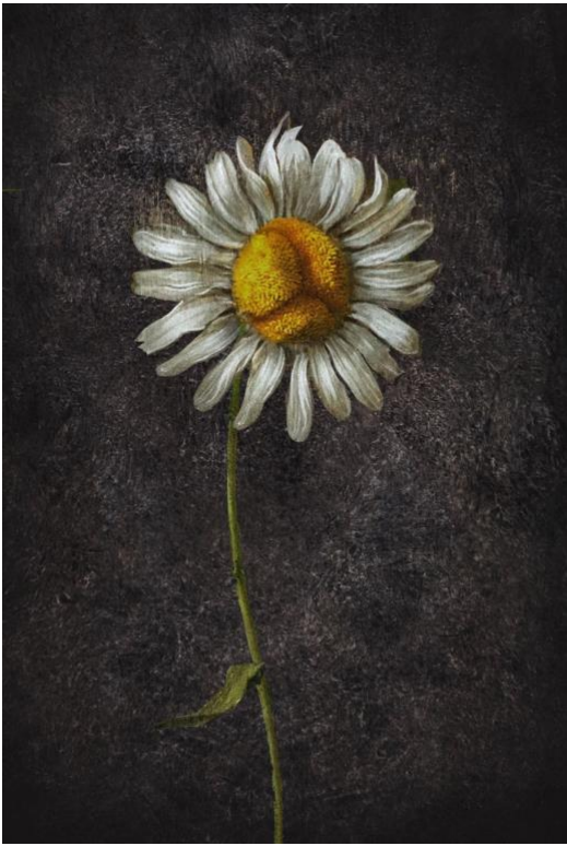
Laurent Grasso. Work in progress and research on mutated flowers / Photo :Studio Laurent Grasso / Courtesy of the artist and Perrotin / © Laurent Grasso / ADAGP, Paris 2020