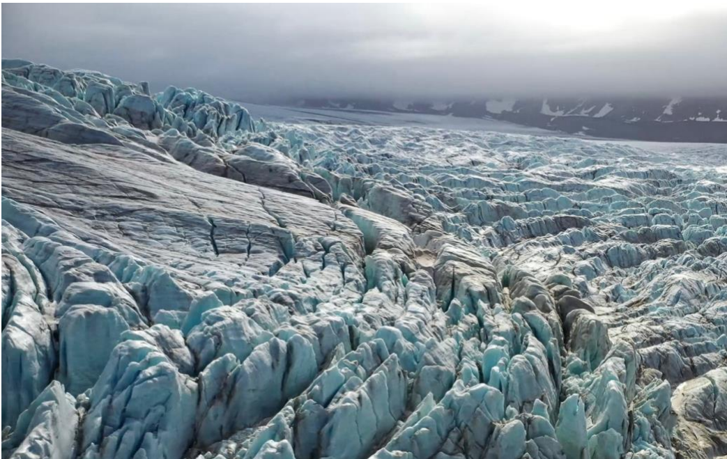
Laurent Grasso. Work in progress (screenshots of a film project) / Photo: Studio Laurent Grasso / Courtesy of the artist and Perrotin / © Laurent Grasso / ADAGP, Paris 2020

Our community is something that we should protect. We are fortunate to be part of this art world and it's great to meet each other and talk, think together. Of course, the lockdown has accentuated the growing importance of the world's virtualization. But this crisis will restore a good balance between the pleasure of being together and the necessary space and time we need individually to think. I hope that people who appreciate and look at art will focus on artists, helping to create interesting ways of seeing the world.