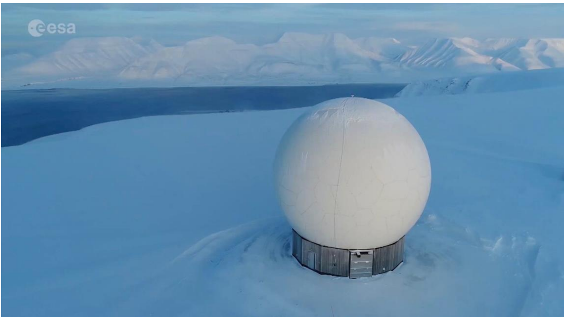
Laurent Grasso. Work in progress (screenshots of a film project)