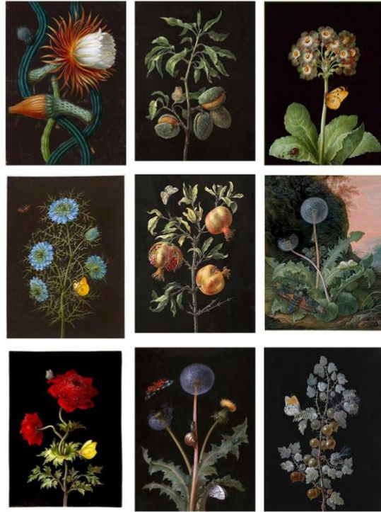
Exemples de planches botaniques

Laurent Grasso. Work in progress and research on mutated flowers / Photo: Studio Laurent Grasso / Courtesy of the artist and Perrotin / © Laurent Grasso / ADAGP, Paris 2020