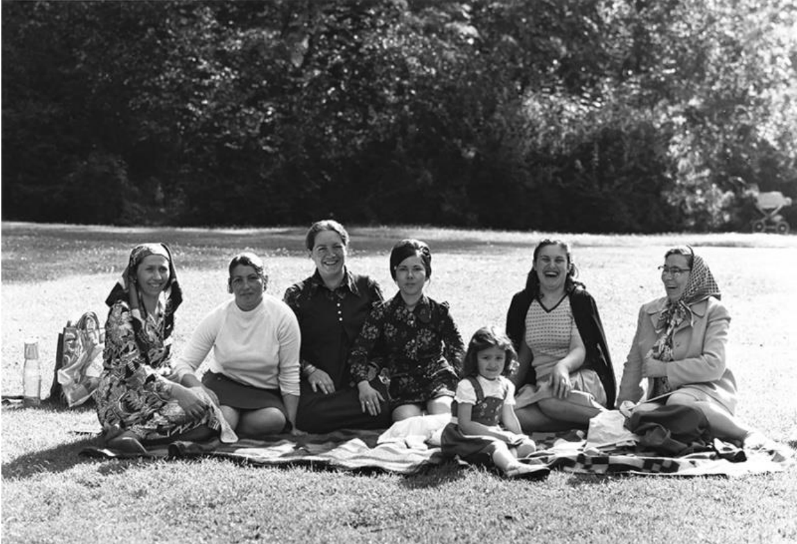
CANDIDA HÖFER'S VOLKSGARTEN KÖLN | 1974, 1974.

CH: I do not feel like I have control over a space. What I try to do is to capture what I would call 'an aspect of a space at a given moment,' but it always remains an aspect.