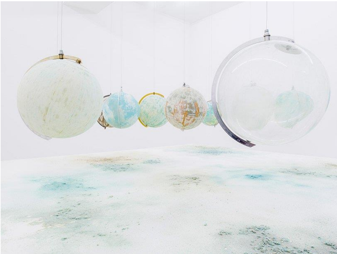
we are all astronauts, 2013 | centre culturel suisse, paris, france, 2014

charrière has travelled to some of the most remot regions of the planet, researching geology, biology, physics, history and archaeology. the title of the work, 'we are all astronauts', is inspired by the writing of architect visionary buckminster fuller, and is composed of world globes stripped clean of their geographic information. dating from 1890 to 2011, the artist sanded away the globes' varying successive and shifting geopolitical contours using 'international sandpaper' created with mineral samples from all U.N. recognized countries, which the artist originally created in his previous works, monument – sedimentation of floating worlds (2013). dust created by the abrasion gently settles beneath the globes, creating new, yet-to-be-defined cartographies. the globes are rendered as useless as their carefully drawn territories in an increasingly globalized world bound less and less by borders.