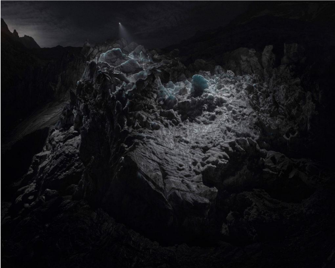
Installation view of Julian Charrière: Towards No Earthly Pole at Sean Kelly, New York January 31 – March 21, 2020

“Towards No Earthly Pole” is centered around the US premiere of the artist’s video work of the same name. The exhibition continues Charrière’s exploration into how human civilization and the natural landscape are inextricably linked. The powerful impression made on him by the Antarctic landscape and his readings of accounts of early 20th-century exploration led him to focus on Iceland, Greenland, the Rhône, Aletsch glaciers, and Mont Blanc in France. This meditative 102-minute film, the result of a series of expeditions made between 2017-2019, combines footage taken from each of the locations. Filmed at night, the dazzling landscapes Charrière captured are dramatically lit by a spotlight carried on a drone; as light tracks across the dark terrain, incredible shapes and tonalities of an almost otherworldly nature are revealed. The exhibition offers a unique vision of polar landscapes, inviting a unique consideration of their mythos, delicate ecology, and fraught geopolitical condition.