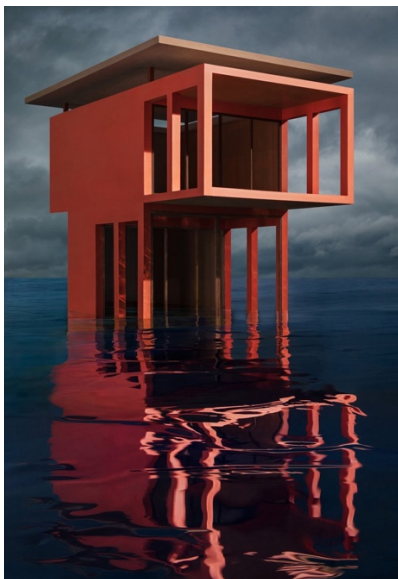
red/orange solo pavilion, 2018

JC: the proportions and design of the building itself first of all, and then the relationship to the backdrop, lighting, and reflection, as well as the sky which I shoot separately and drop in later.