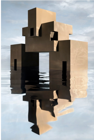
brutalist house on water, 2019

paris on january 11th, 2020. designboom speaks with james casebere about his design process with the series 'on the water's edge.'