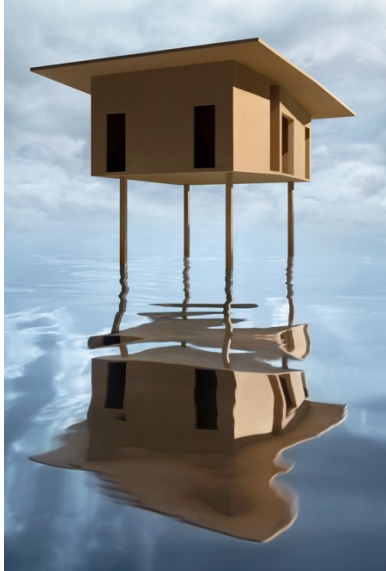
tan house on stilts, 2019

DB: when photographed at that level of detail, what is the most important part of the physical process of model making?