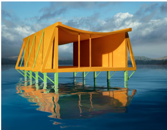
orange house on water, 2019

james casebere (JC): my interest in architecture and landscape has always been there and now — our greatest challenge is to deal with the climate crisis, so my work simply takes this into consideration.