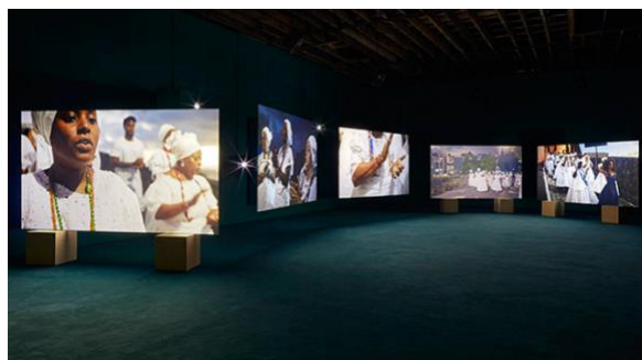
Isaac Julien's 'Lina Bo Bardi — A Marvellous Entanglement' (2019)