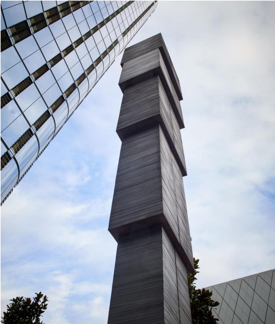
65,000 Photographs at One Blackfriars, by Idris Khan, 2019. 65,000 Photographs was originally commissioned by London Borough of Southwark as part of the One Blackfriars Public Art Programme on behalf of St George City Limit

growing in size in relation to dimensions of standard photographic prints: 5x7, 10x7, 12x16 inches and so on.