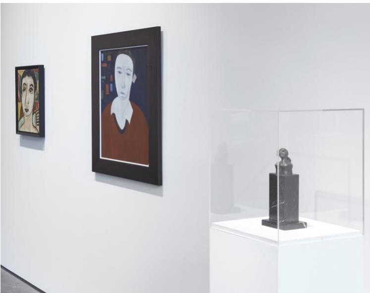
1960; "Portrait of the Painter Servando Cabrera," 1952; and an untitled bronze sculpture, 1949, the earliest work in the show

By 1950, Soldevilla was already starting to experiment with abstraction, and the exhibition includes a small canvas from that year.