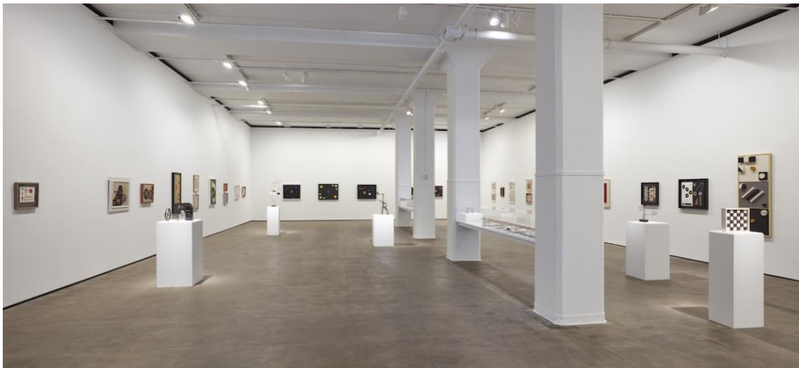
A view of the exhibition's main gallery

Now, almost 50 years after her death, Soldevilla—better known as Loló—is having her first large-scale retrospective outside Cuba, at Sean Kelly Gallery in New York.