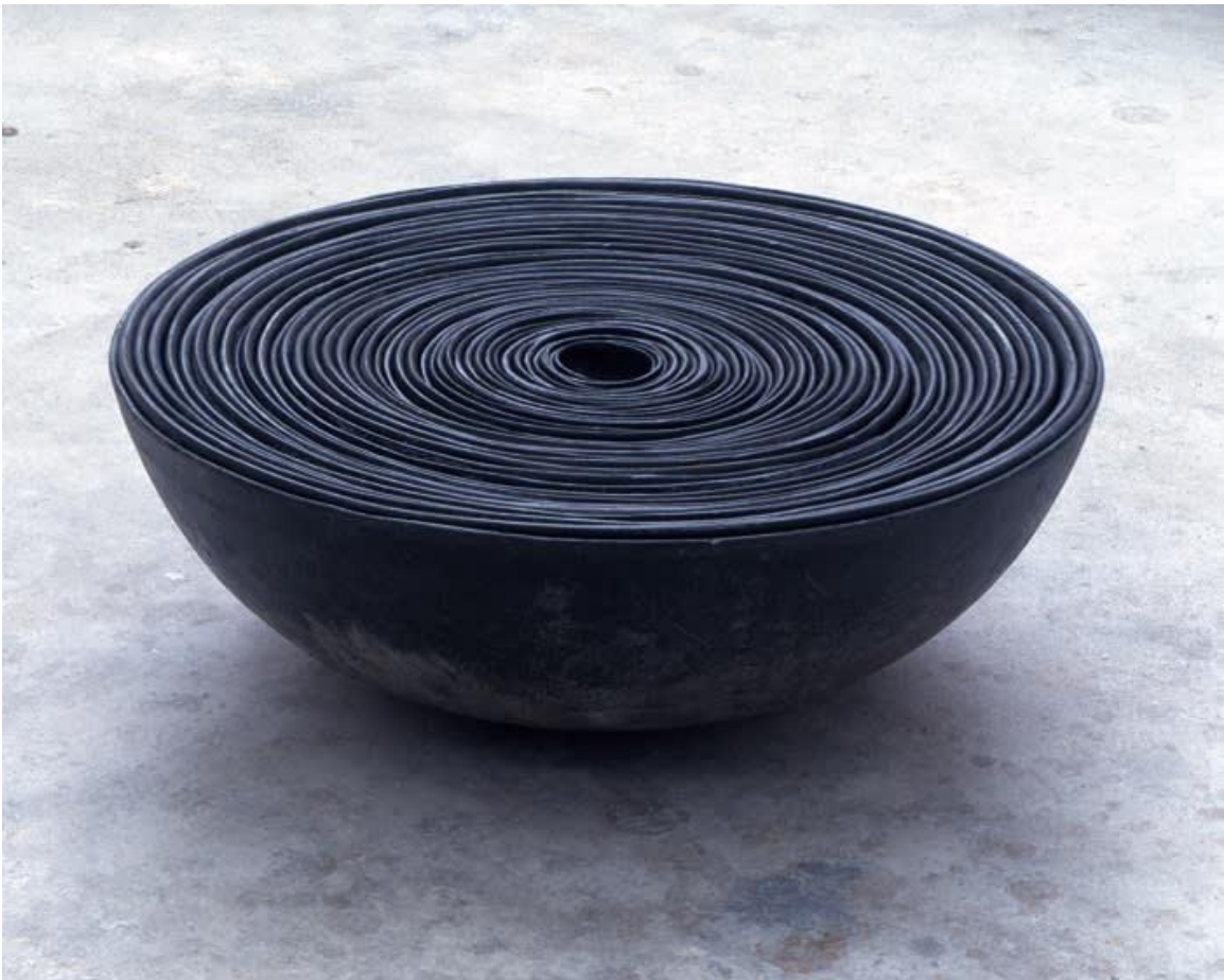
'Full Bowl' (1977-78) © Antony Gormley/Stephen White, London

into what might look “like a builder’s yard”, the slabs pinned but not fixed, “their deadweight doing its stuff”, so that “your intuitive understanding of how it feels to inhabit a body can be projected on to the works, and can become yours”. This might end up being suggestive “of the weight of a body against the floor or the way we clasp our hands across our chest when lying on a beach”. Even so, the figures “aren’t pictures of something”, but “something you have to make sense of . . . a collective image”.