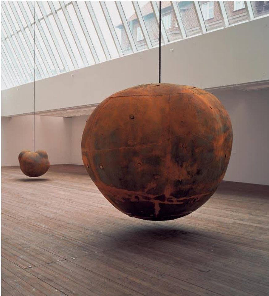
'Body and Fruit' (1991-93) © Antony Gormleyt/Jan Uvelius, Malmö Konsthall

Gormley is famous for replacing that idealisation with material, biological reality — “what you see is what you get” — and for reimagining human monumentality as intensified by being scaled down to natural dimensions, rather than forever duelling with the hulk of Michelangelo. His figures, whether erect or bent, overlook their surroundings in contemplative dialogue rather than taking possession of them; they are players not statues, and all the more emotionally and philosophically potent for that.