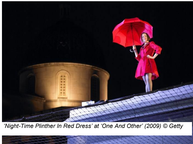
'Night-Time Plinther In Red Dress' at 'One And Other' (2009)

The ask is important. Gormley says, "I'm not interested in the making of spectacles that depend on special conditions and highly tuned technology and that point you to attend to the rainbow spectrum or the ancientness of a piece of ice. I want to leave people alone to attend to themselves." In the bigger pieces like