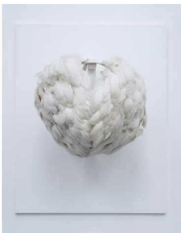
Rebecca Horn "Cornucopia: Séance for Two Breasts" (1970)

The cinematic spine of Horn's work in Metz appears to me romantic, methodical, and decisive — her elements reappear over time within different contexts as recurring characters, à la Balzac. This repetition gives her body of work a satisfying stylistic consistency and profundity seen rather rarely today. But even with that consistent silver vein of references running through her work, I was startled by the sheer abundance of artistic and intellectual viscera on display here. Not only are numerous art historical connections sparked within the brain, but respectful precedents are unambiguously established by the Metz curators' placement of Horn's artistic influences and spiritual peers alongside her work throughout the show. Thus diving into her life's work feels like a feat of cartography as much as an opportunity for art critique.