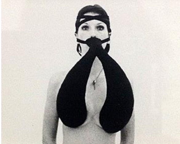
Rebecca Horn "Cornucopia: Séance for Two Breasts" (1970)

Likewise is the love/hate heat in the peek-a-boo driven "Feather Instrument" (1970) costume, filmed in use in the mesmerizing Performances 1 (1970–1972) film. Here, an idyllic, young naked man's hairy body is peeked at by two young women as they lift and drop the white feathered blinds of his box garment by pulling the strings. Following Horn's 1970s performances with body extensions, masks, and feather objects came her first kinetic sculptures that were