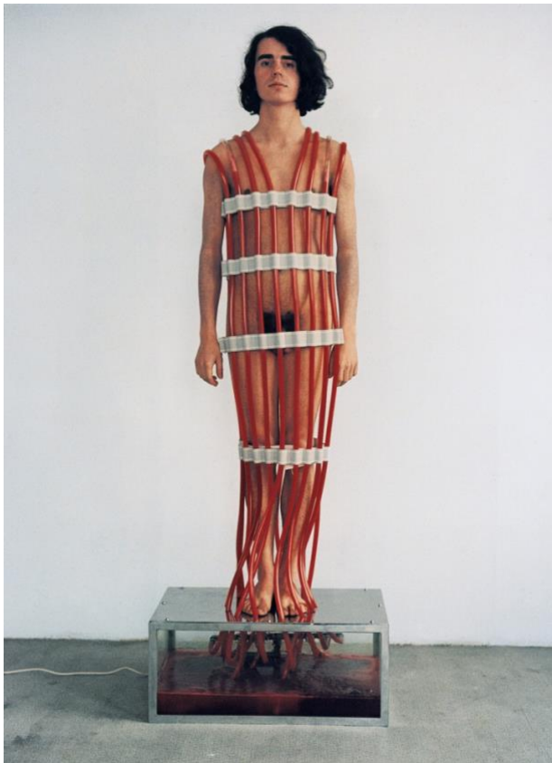
Rebecca Horn, "Overflowing Blood Machine" (1970) (Tate Collection, London @ Rebecca Horn/ProLitteris, Zürich; courtesy Tinguely Museum)

Another of her grand subjects appears to be unobservable force-field energies and their pressures of attraction and repulsion and circulation that pass through and around the human body. This is perhaps best exemplified with the photograph of the young man wearing her "Overflowing Blood Machine" (1970). This blood flow theme is made encroachingly poignant by the partially debilitating stroke Horn suffered in 2015.