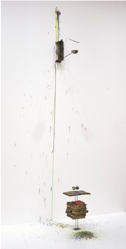
"Salome Body Fantasies" (1988) Rebecca Horn Collection, Rebecca Horn/ProLitteris, Zürich

strangeness of the human animal. This mood is also felt in the Achim Thode's photograph "Unicorn" (1970) in Theatre of Metamorphoses , taken as part of Horn's famous private performance film Unicorn (1970) that was inspired by the Czechoslovakia border crossing scene in Jean Genet's 1949 book The Thief's Journal . Horn's enchanting Super 8, 12-minute, color film is a definite highlight of the Metz show. It opens with the elegant mystery of Kenneth Anger's short avant-garde film Artificial Water , (1953) that presents petite Carmilla Salvatorelli, made fairy-like, walking stately in the Garden of the Villa D'Este in Tivoli, Italy. After noticing the similar feel in the start of these two films, I later learned that Horn had indeed studied with Anger in Hamburg.