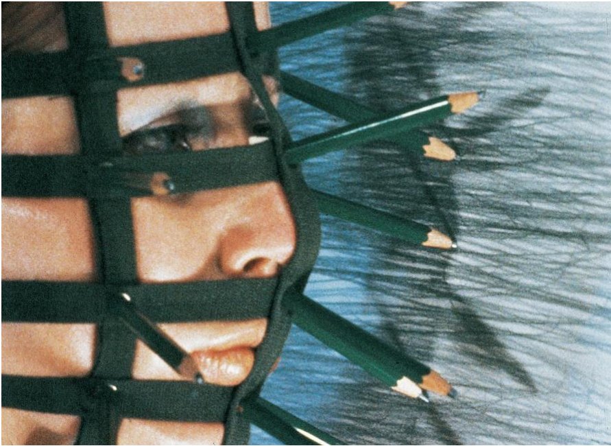
Rebecca Horn, "Pencil Mask" (1973), 16mm film still, Ton Fabre, (Rebecca Horn Collection, @ Rebecca Horn/ProLitteris, Zürich; courtesy Tinguely Museum)

as a chimera, or as mechanically glamorous as a Black Forest cuckoo clock.