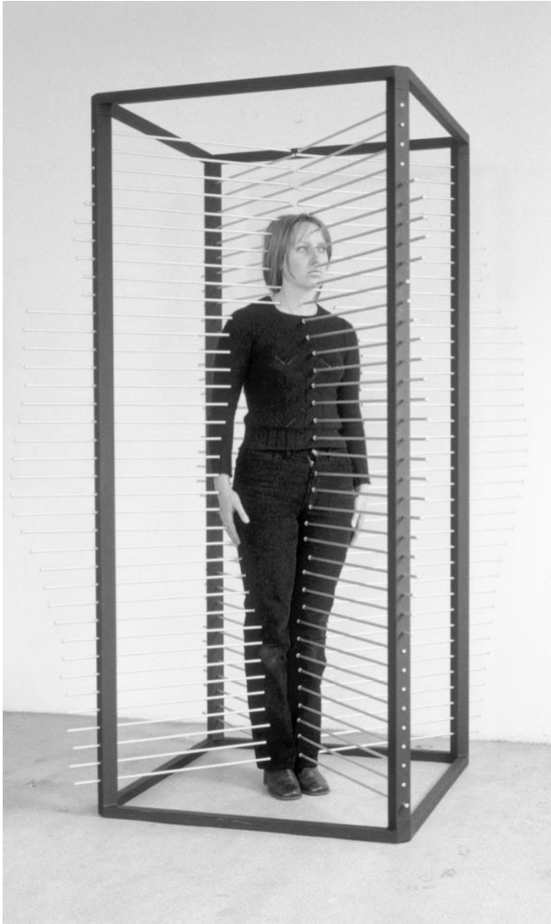
"Measuring Box" (1970) photograph, Staatsgalerie Stuttgart (@ Rebecca Horn/ProLitteris, Zürich; courtesy Tinguely Museum)

Horn's work with such elaborate metamorphic constructions in Body Fantasies only flounders when it goes demimondaine by becoming too big and too much like a movie set. Such is the case with the coldly sprawling "El Rio de la L una" (The Moon River, 1992): a metallic conduit system comprised of seven mercury-pumping boxes, or "heart chambers." With such sprawling sculptural installation pieces Horn may not have anything to be ashamed of, but she plays no part in the resistance to mass spectacle. Her woozy sex-machine art works best as intimate agents of self-transcendence. Sometimes vast scale works well for a pensive artist keen on psychosexual semiotics, but this wasn't one of those times.