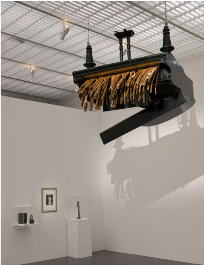
Installation view of Theatre of Metamorphoses

The Centre Pompidou-Metz and Museum Tinguely have joined together to present a remarkably diverse and prolific two-part exhibition devoted to the German artist Rebecca Horn.