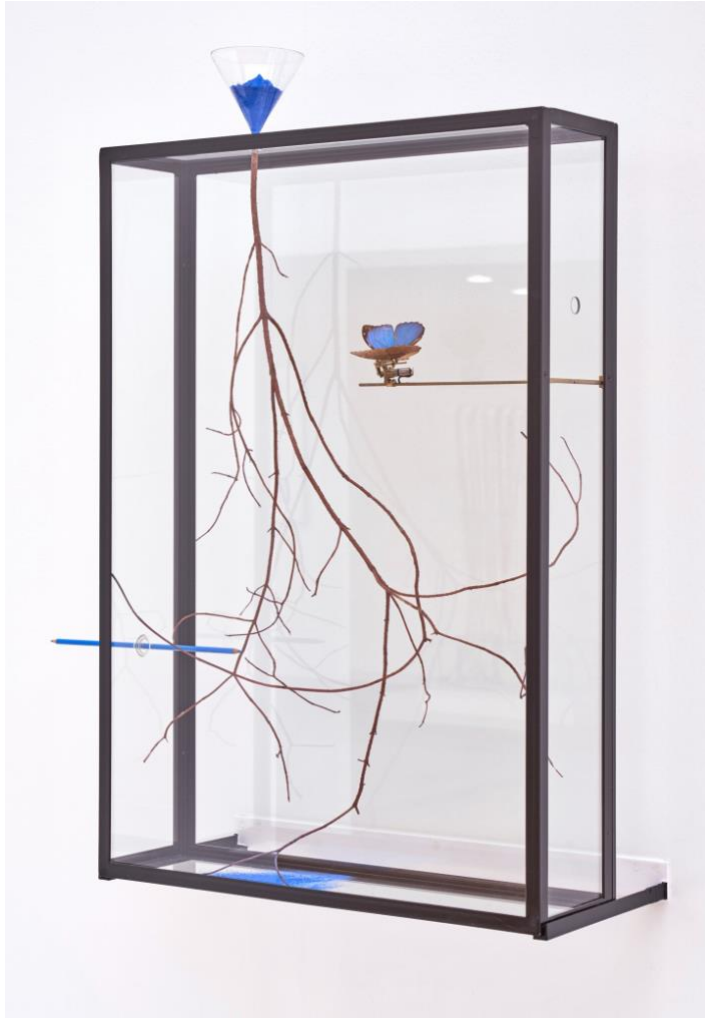
Rebecca Horn, "Butterfly Body Fantasy" (2009) Rebecca Horn Collection, Rebecca Horn/ProLitteris, Zürich

timelessness. With the beautiful "Butterfly Body Fantasy" (2009), Horn's gorgeous, non-stop, mechanically fluttering butterfly box, her work takes on a Joseph Cornell-like mythical inference, but even more crammed with exquisite subtleties. Its motorized, iridescent, blue morpho flapping wings lured me into an infinite private tumult of contradictory impulses that never stop fluttering.