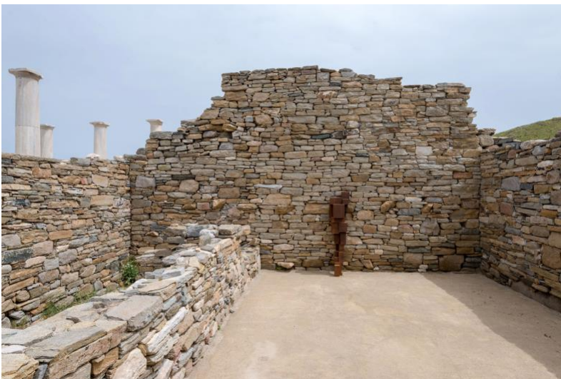
Side II, 2017, by Antony Gormley is exhibited amongst Delos' ruins

The figures are displayed across the island, including among ruined ancient columns, at the centre of an amphitheatre, at the water's edge and standing in the sea.