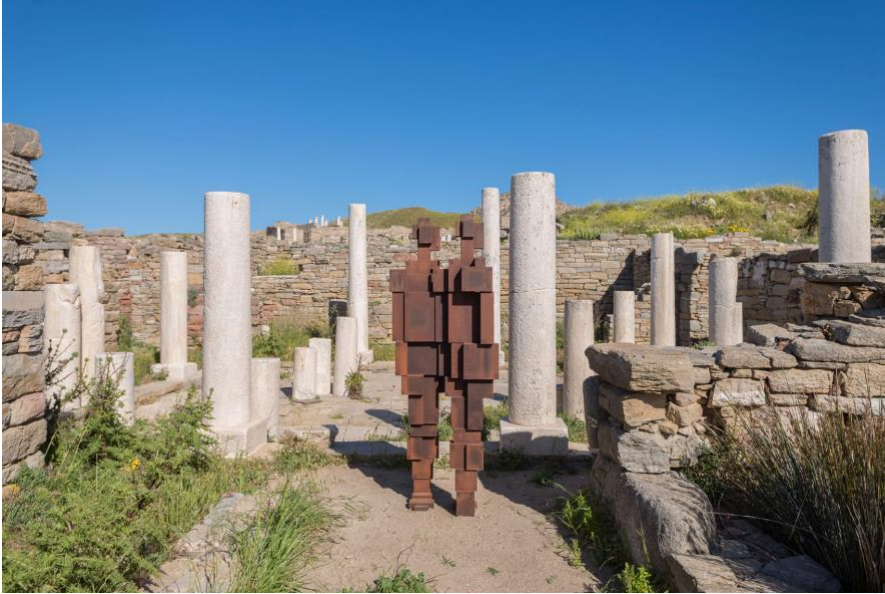
Antony Gormley's sculpture Connect, 2015, is one of the 29 on display this summer

"Sculpture is a threshold to another attitude to time; it provides the invitation to escape mechanised time as we know it."