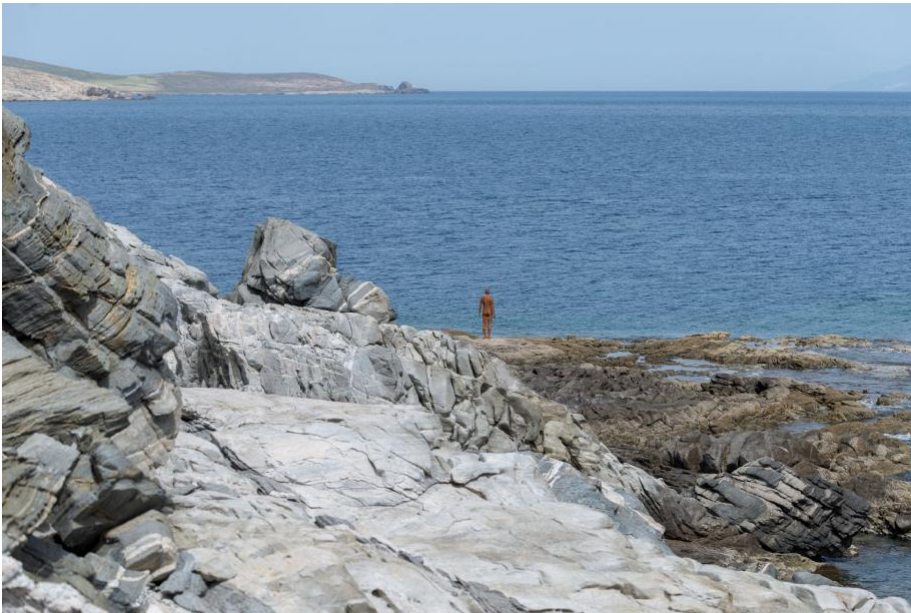
Antony Gormley's Another Time XIV, 2011, looks out over the Aegean sea

British sculptor Gormley, creator of the Angel of the North, has installed the forms across the island taking advantage of both the scenery and ruined ancient Greek and Roman architecture.