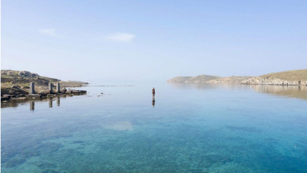
Antony Gormley's 6 Times Left, 2009, is part of the Sight exhibition on Delos

Artist Antony Gormley has unveiled Sight, an exhibition of 29 of his humanoid sculptures on the Greek island of Delos in the Aegean sea.