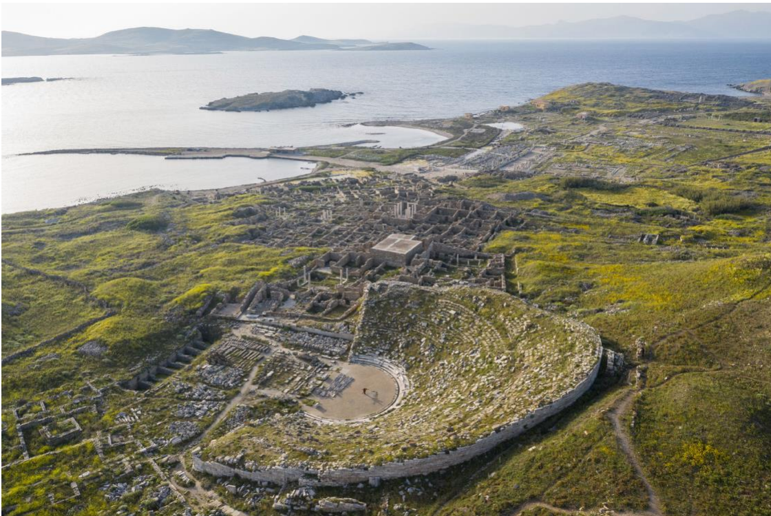
Sight by Antony Gormley displayed at the archaeological site of Delos Island

The exhibition, which is accessible via boat from Mykonos, Paros and Naxos Islands, is on display until 31 October 2019