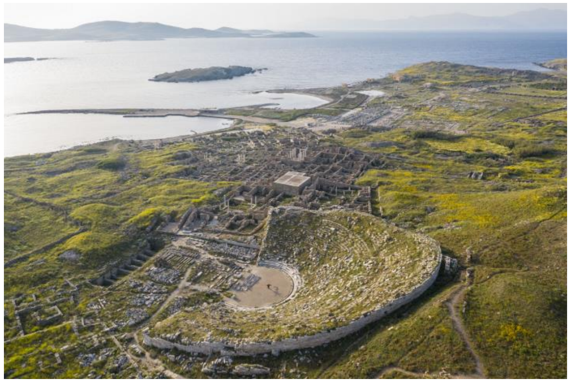
Antony Gormley, SIGHT, at the archaeological site of Delos Island, 2019.

British artist Antony Gormley is the first to present new works on the island, a UNESCO world heritage monument and important site in Greek mythology, since was inhabited.