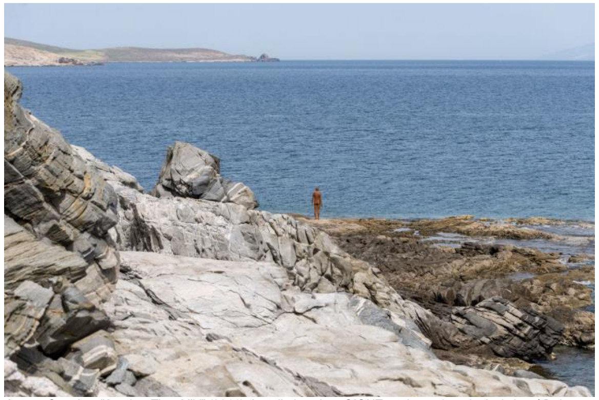
Antony Gormley, "Another Time XIV" (2011). Installation view, SIGHT, at the archaeological site of Delos Island, 2019.

In his installation, the Turner Prize-winning artist repopulates Delos with life-size humanlike iron "bodyforms" in addition to tens of cubic and abstract sculptures. Gormley will present five new sculptures in addition to 29 work from the past 20 years of his career. The works are featured throughout the island's temples, altars, agoras, and some are blended with its topography and natural views. It is the first installation to ever be unanimously approved by the Greek Archaeological Council to take place on the island.