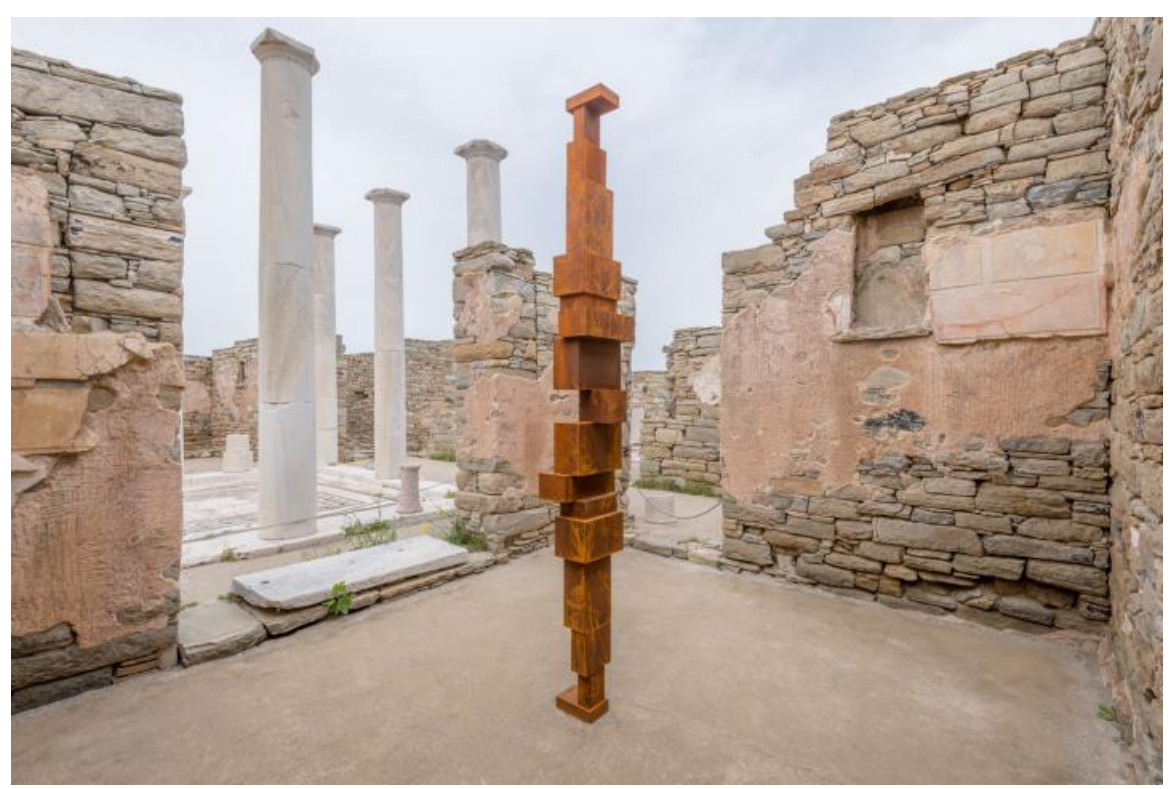
Antony Gormley, "Reflect" (2017). Installation view, SIGHT, at the archaeological site of Delos Island, 2019.

SIGHT is curated by Iwona Blazwick OBE, director of Whitechapel Gallery in London, and Elina Kountouri, director the non-profit NEON. The installation will be on display from May 18 to October 31, 2019.