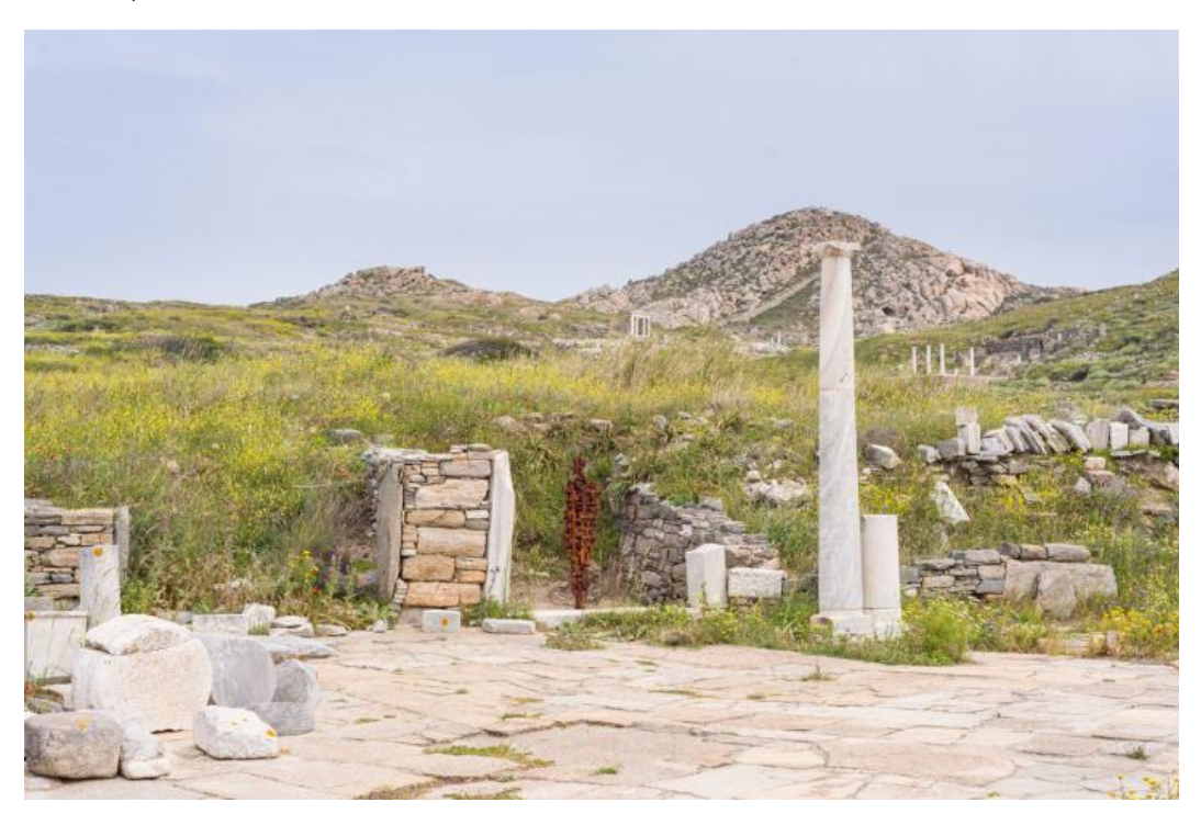
Antony Gormley, "Cast III" (2009). Installation view, SIGHT, at the archaeological site of Delos Island, 2019.