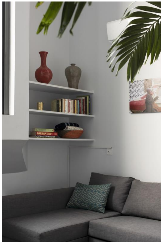
Details of an apartment for visiting artists. Ian D Warren. © 2019 Kehinde Wiley. Used by permission.