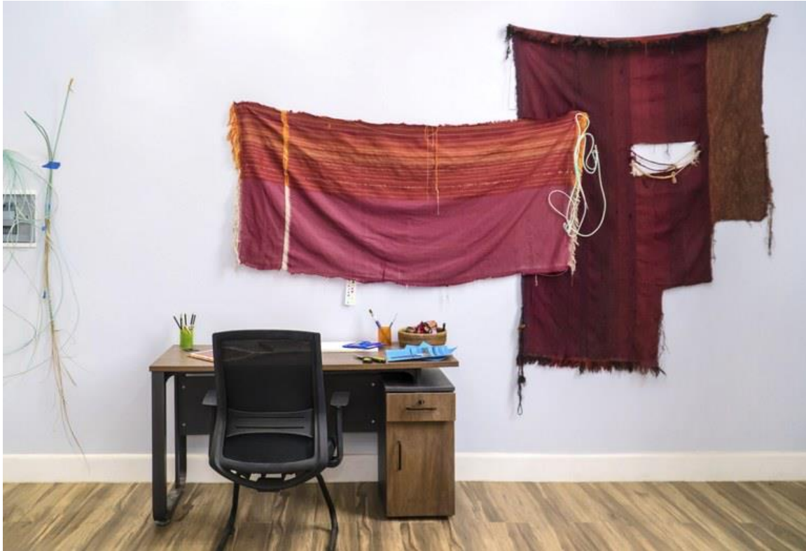
Studio space for visiting artists.

For his forthcoming studio in Lagos, the same city where his estranged father is from, Wiley is working with Ghanaian British architect David Adjaye on the design. “I always wanted to have a space in Lagos,” says Wiley. “I had a site visit with the architect who is going to be putting together something really special in Lagos, I hope.”