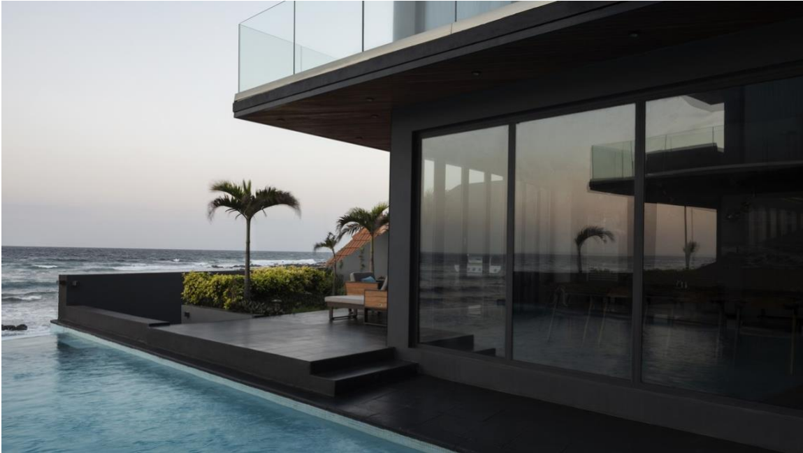
An exterior view of Black Rock Senegal.

These days, Kehinde Wiley is doing more than just painting in his Brooklyn studio. The famed Barack Obama portraitist is establishing an art studio in Lagos, Nigeria, an artist residency in Dakar, Senegal, and a solo exhibit in Paris. Wiley is known for fusing the past with present by painting African Americans in the style of Old Masters paintings. Having grown up in a poor neighborhood of South Central L.A., going to art school in Russia as a preteen, and studying art at Yale University, he broke into the art scene in the early 2000s with his “Hip Hop Honors” series, which consists of paintings of rappers like the Notorious B.I.G. and Ice-T.