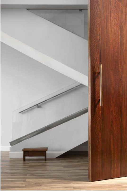
The entryway to Black Rock Compound, whose doors are made of Cameroonian Amazakoue wood. Ian D Warren. © 2019 Kehinde Wiley. Used by permission.