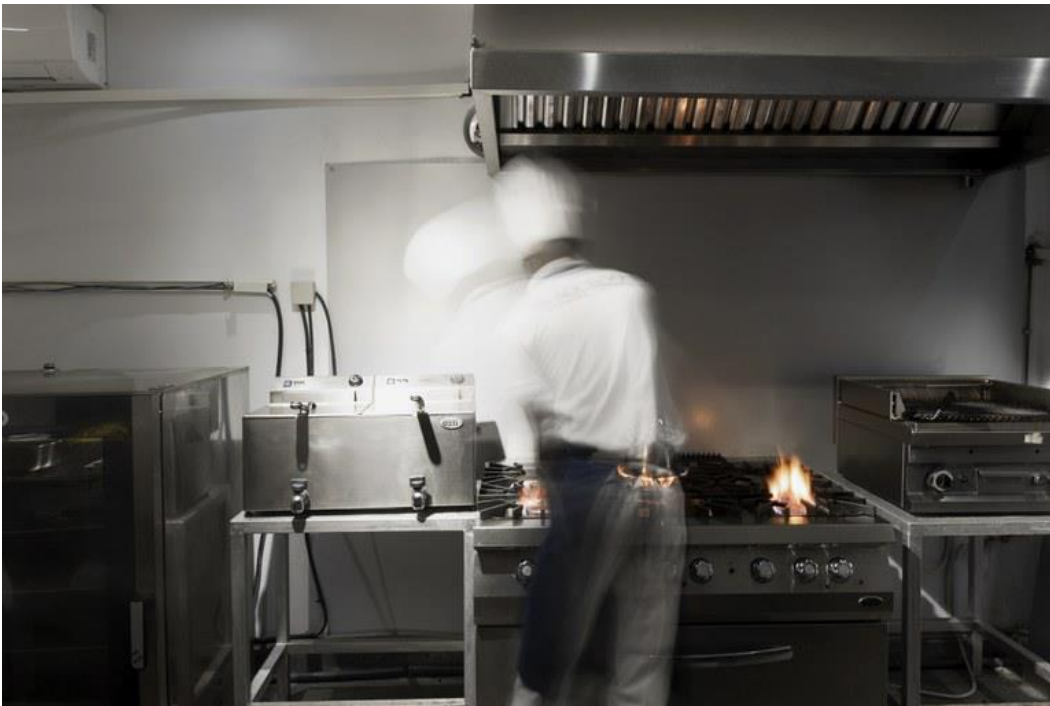
A chef's kitchen, which will blend art and gastronomy. Ian D Warren. © 2019 Kehinde Wiley. Used by permission.

The front doors on the sleek, black buildings are made from Cameroonian Amazakoue wood, which, Djenne says, faces away from "the gate of the departure where the slaves of Gorée left to the Americas," he says. Wiley's studio is 4,000 square feet, while the residency is a 2,000-square-foot space. The living/work space will have artists create with art but also with gastronomy. There will be a kitchen where chefs can blur the lines between art and cuisine.