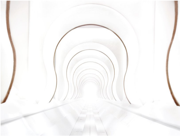
edificio basurto ciudad de méxico I 2015