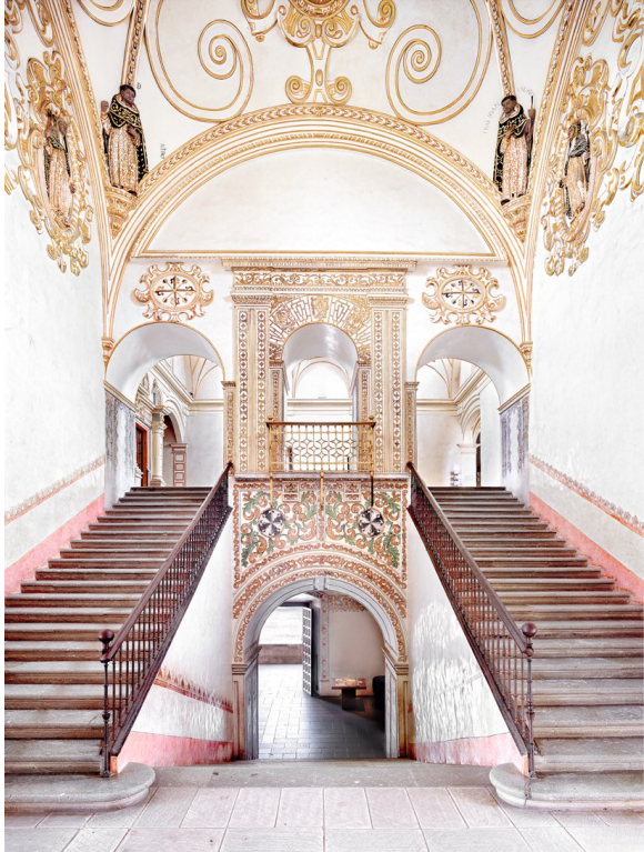
convento de santo domingo oaxaca IV, 2015