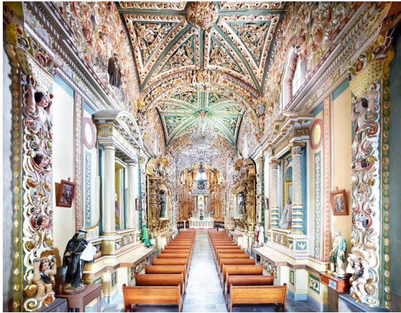
iglesia de santa maria tonantzintla I, 2015