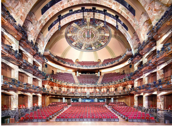
palacio de bellas artes ciudad de méxico III, 2015