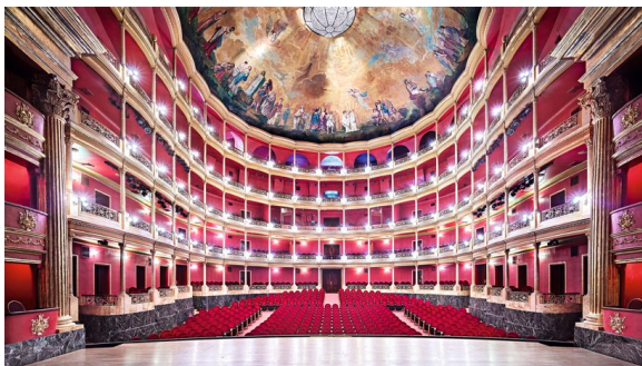
teatro degollado guadalajara I, 2015