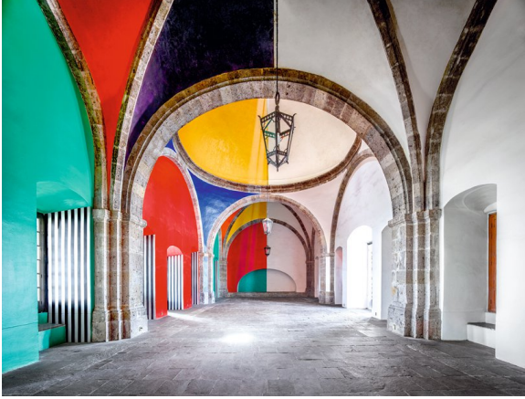
hospicio cabañas capilla tolsá from daniel buren work in situ guadalajara I, 2015