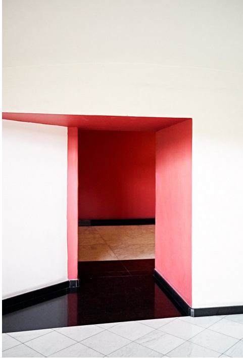
passage II, 2015