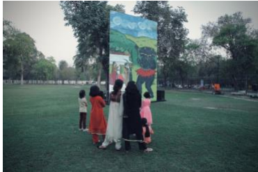
Shahzia Sikander, "Disruption As Rapture" (2016), HD video animation, original music by Du Yun featuring Ali Sethi, animation by Patrick O'Rourke, duration: 10 min. 7 secs.

Not even the most erudite of scholars can decipher the text of the Gulshan-i 'Ishq let alone grasp the story's many layers given its heterogeneous qualities: for Sikander, this was a productive point of entry into the work.