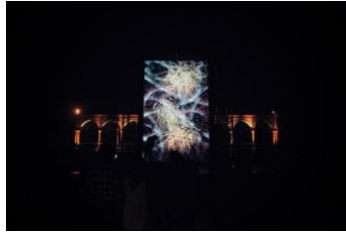
Shahzia Sikander, with Du Yun, Ali Sethi, Catholic Girls Choir and Young Children of Traditional Musicians from the Walled City of Lahore, Darbaar-e-Aam, Lahore Fort. "Disruption As Rapture" (2018)