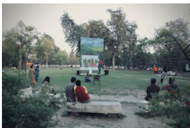
Shahzia Sikander, “Disruption As Rapture” (2016), HD video animation, original music by Du Yun featuring Ali Sethi, animation by Patrick O’Rourke, duration: 10 min. 7 secs.

One of the two locations in which the animation “Disruption as Rapture” was installed was Alhamra garden, a space open to the public until midnight. The 10-minute film is an interpretation of the 18th century manuscript Gulshan-i ‘Ishq (Rose Garden of Love) in the Philadelphia Museum of Art’s collection. The poem is written in masnavi form in Deccani Urdu and Persian naskh script, the language of the Muslim elite in South-Central India. This North Indian Hindu love story is recast as a Sufi tale for an Islamic court.