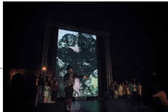
Shahzia Sikander, with Du Yun, Ali Sethi, Catholic Girls Choir and Young Children of Traditional Musicians from the Walled City of Lahore, Darbaar-e-Aam, Lahore Fort. "Disruption As Rapture" (2018)