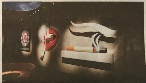
DEW BURGON ART FOUNDATION, ARTISTS SOCIETY GALL, NEW YORK, ALL RIGHTS RESERVED BY ARTISTS SOCIETY GALL, NEW YORK