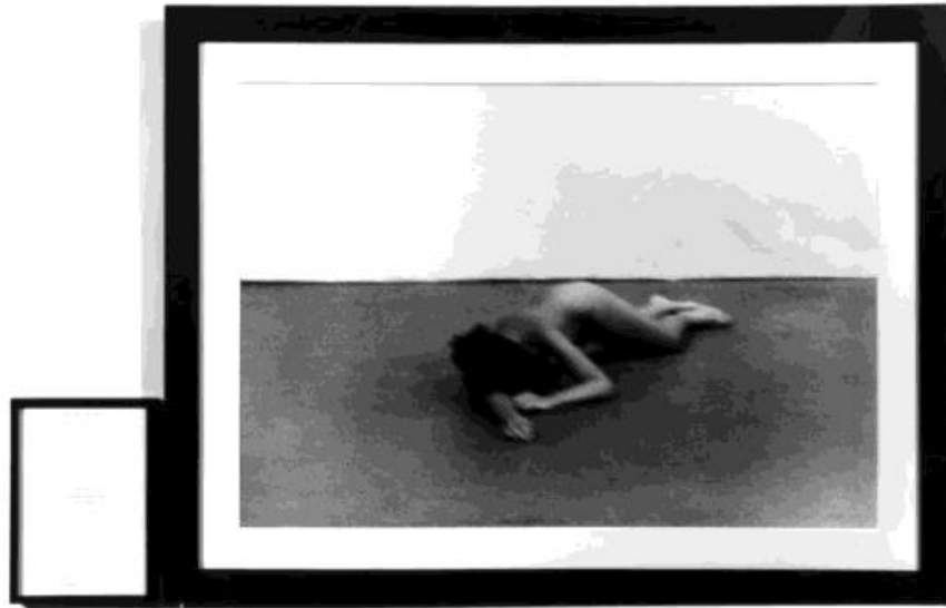
Marina Abramović, Freeing the Body , 1975; publ. 1994. Black and white photograph with letterpress text panel, 29 3/4 x 39 1/2 in.

If the still images give you album-cover moments, the videos of Abramović's performances downstairs are closer to the events in full—or as full as video can make them.