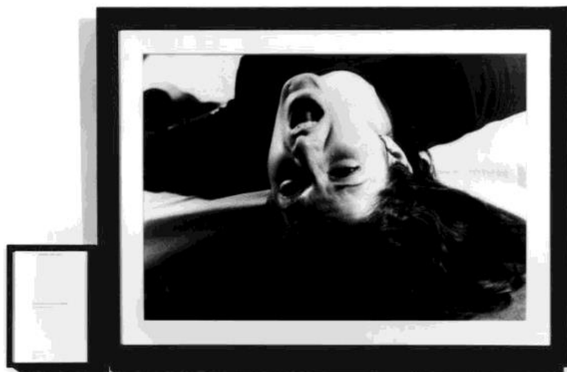
Marina Abramović, Freeing the Voice , 1975; publ. 1994. Black and white photograph with letter press text panel, 29 3/4 x 39 1/2 in. Marina Abramović Archives and Sean Kelly, New York

Marina Abramović is the doyenne of performance art. She captured that status with her regal presence in 2010 at the infinitely expanding Museum of Modern Art—nothing if not a gleaming palace—when her performance The Artist is Present consisted of staring, in a long gown, at whomever was sitting across from her.