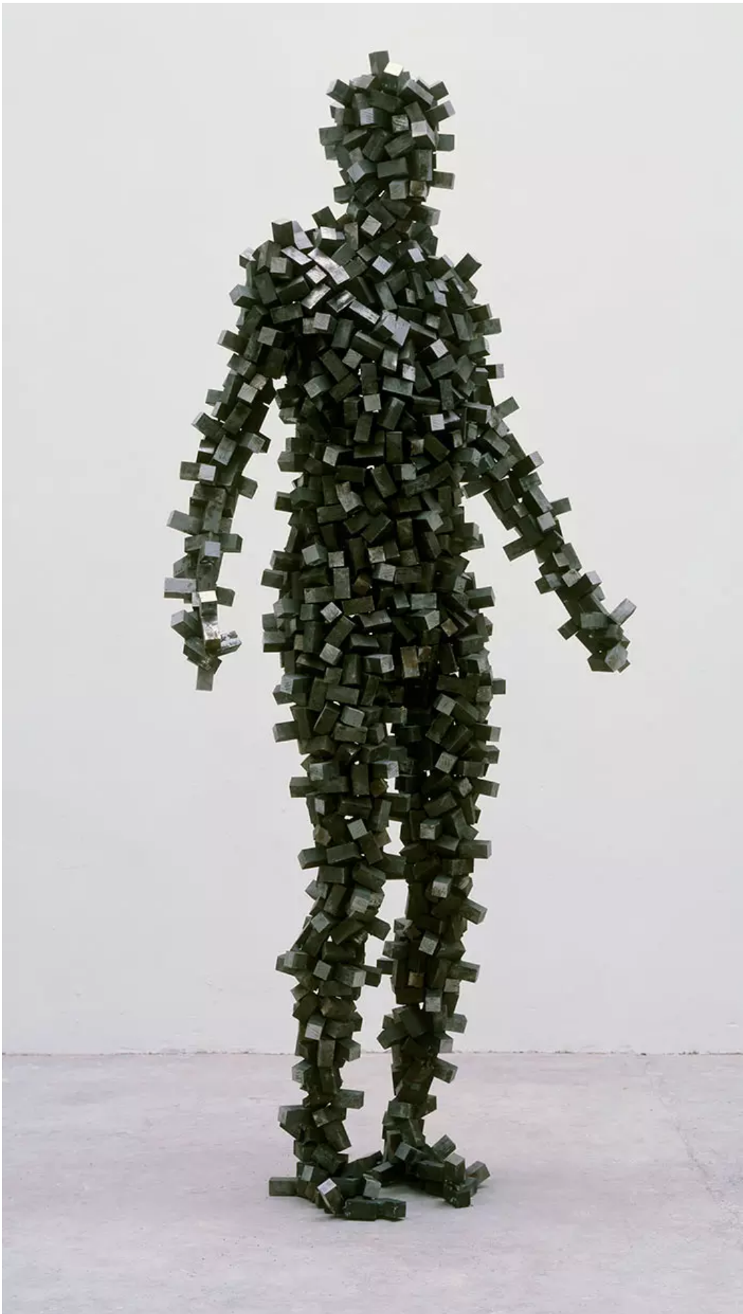
'Distress' (2001) Antony Gormley