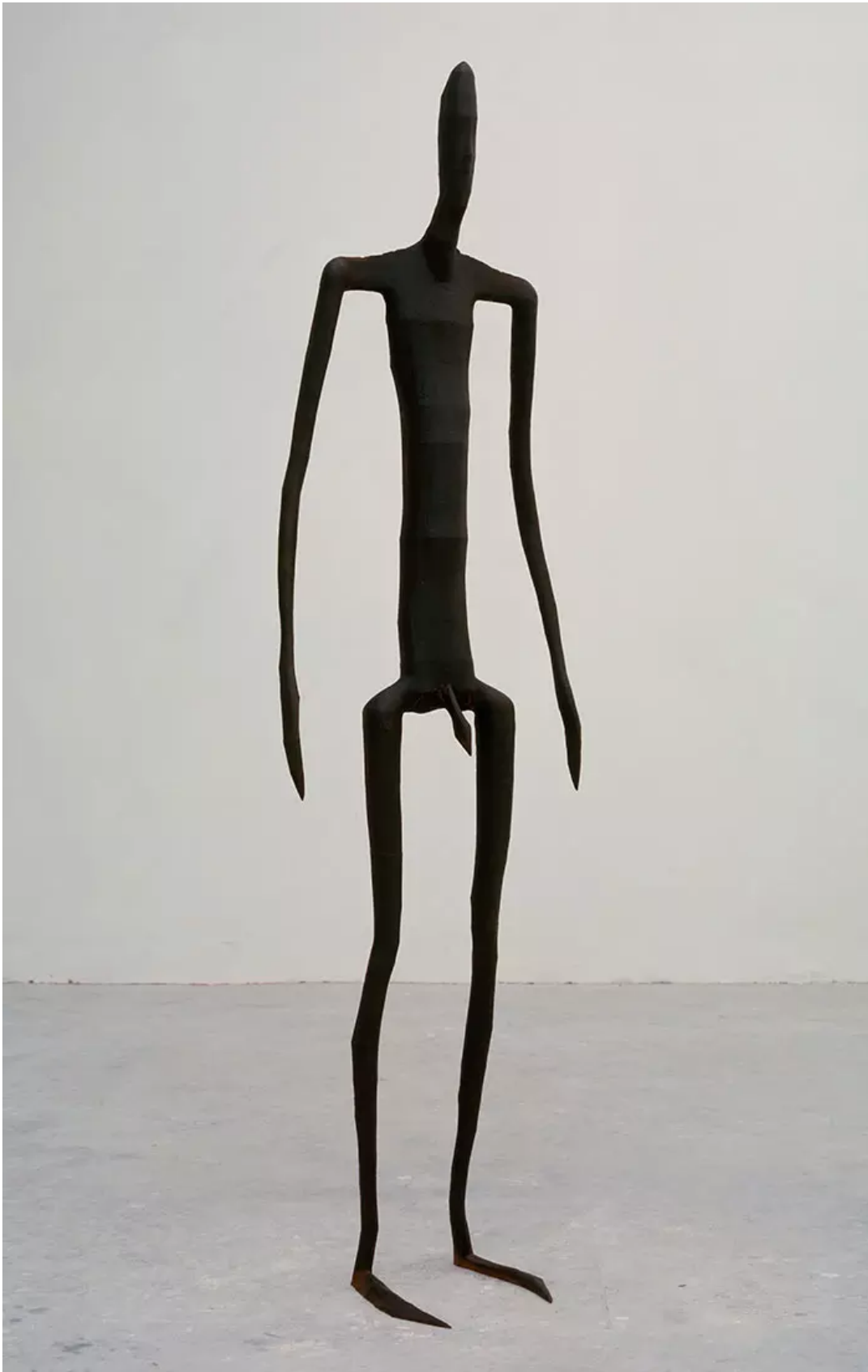
'Insider VII' (1998)

At Goldsmiths, Gormley found himself torn between two competing schools of thought: one that regarded art as a continuum, and the other that called for it to be revolutionary. “I thought, what I would like to make is a revolutionary continuum,” he says with the vaguest hint of mischief. Those philosophical investigations led him to the subject that has inspired his work ever since: the body.