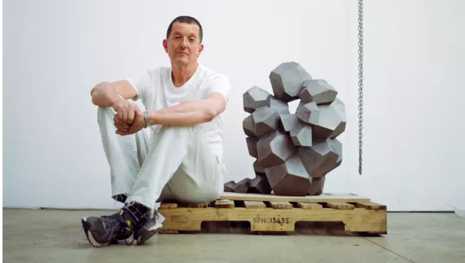
Sculptor Antony Gormley

The sculptor talks about a new book that spans his career to date