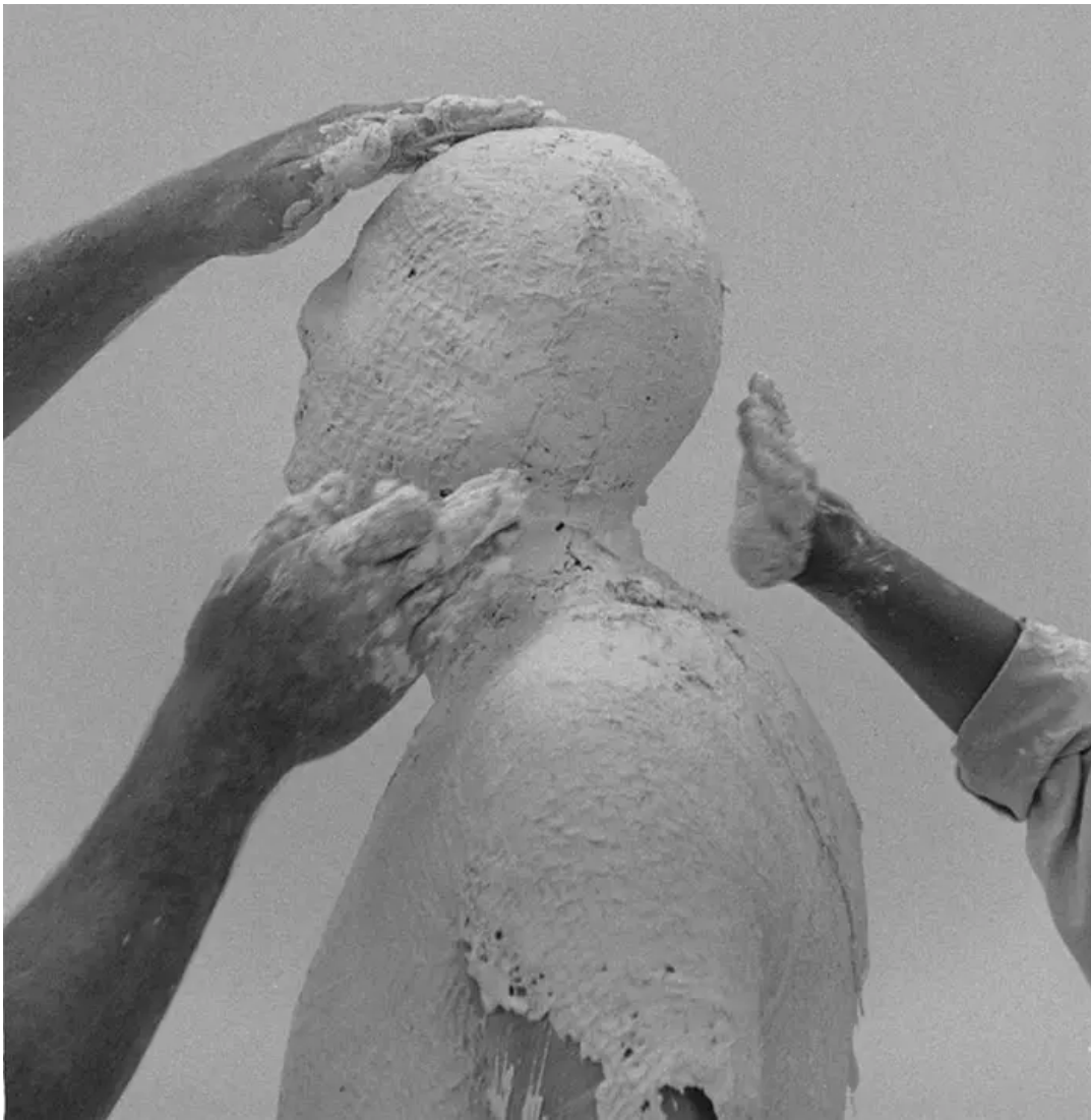
Work in progress for 'Critical Mass II' (1995)

A pet project to send one of his bodies into space — “nobody needs to see it, it would just be the fact of its being there” — foundered when Nasa declined to co-operate. He fears that art, back on planet Earth, has lost some of its inclination to boldly go into uncharted territory. “The commodification of art in our time has removed its identity as an experimental zone. But the taste [among the public] to participate is growing, and that is a wonderful thing.”