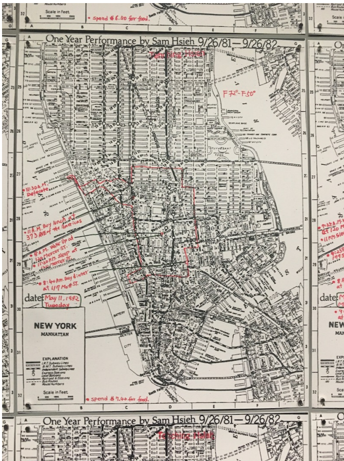
The map for May 11, 1982 of One Year Performance 1981–1982 (Outdoor Piece)

The map for May 11, 1982, exactly 35 years years ago today, reveals that he spent the day in Downtown Manhattan. He woke up at 8 a.m. at 120 Mercer Street in SoHo, bought lunch at 11 a.m. at 373 Avenue of the Americas in the West Village (the address is now home to a nail salon and spa), purchased dinner at 8:40 p.m. at 117 Mott Street in Chinatown (now a realty office), and then went to sleep at 11:30 p.m. back at 120 Mercer (now the back of the Hugo Boss store on Broadway).