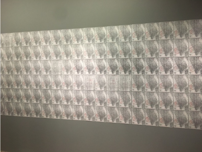
Documentation of One Year Performance 1981–1982 (Outdoor Piece)

The map for May 11, 1982, exactly 35 years years ago today, reveals that he spent the day in Downtown Manhattan. He woke up at 8 a.m. at 120 Mercer Street in SoHo, bought lunch at 11 a.m. at 373 Avenue of the Americas in the West Village (the address is now home to a nail salon and spa), purchased dinner at 8:40 p.m. at 117 Mott Street in Chinatown (now a realty office), and then went to sleep at 11:30 p.m. back at 120 Mercer (now the back of the Hugo Boss store on Broadway).