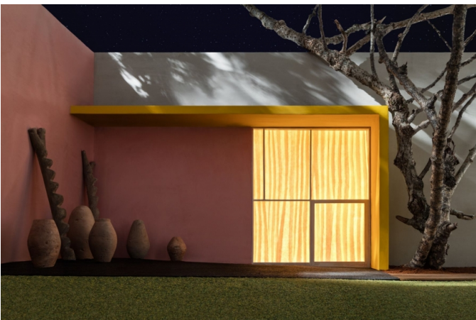
Yellow Overhang with Patio, 2016© James Casebere