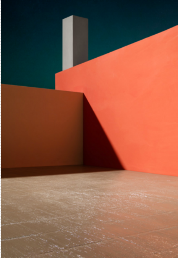
Courtyard with Orange Wall, 2017