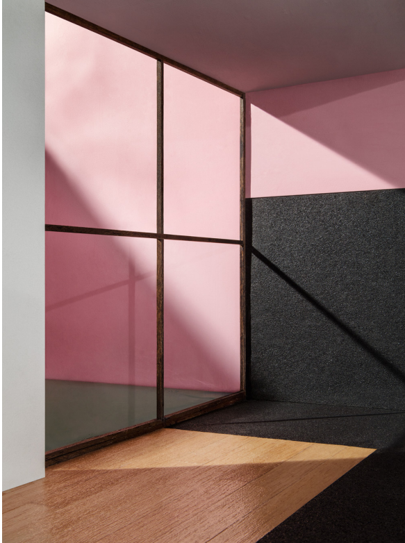
'Reception Room - Casa Galvez', 2017