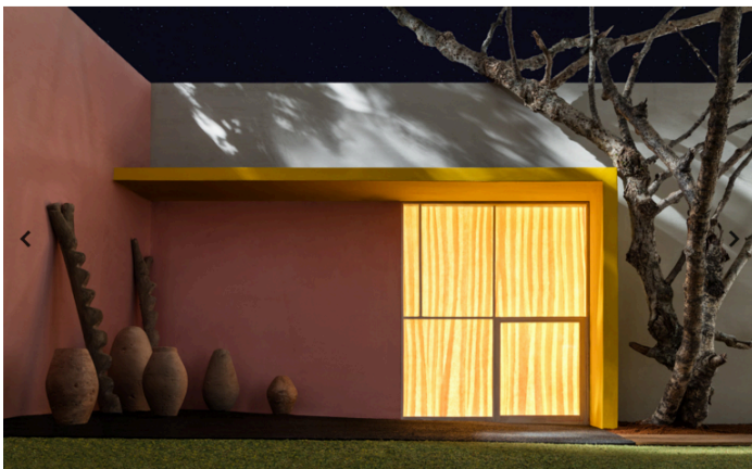
Yellow Overhang with Patio, 2016

'In the gardens and homes I have designed I have always tried to allow for the interior placid murmur of silence,' said Luis Barragán in his 1980 Pritzker Prize acceptance speech. In a new body of work by the American artist James Casebere, that silence sings.