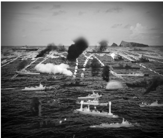
Tsang Kin-Wah, "In the End is the Word" (2016)

The politics of the East China Sea appear again in Tsang Kin-Wah's "In The End Is The Word," which illustrates a fictional war. In a mural-sized animation, battleships fight over the Diaoyu (or, according to Japan, Senkaku) Islands. In real life, the islands have been disputed fiercely between the PRC, Taiwan, and Japan since oil reserves were discovered there in the late 1960s. In Tsang's video, just at the battle's peak, a stream of words appears on the horizon and floods onto the floor of the gallery via powerful overhead projectors. It's a stunning visual effect, and the sentence fragments — e.g. "the infinite slippage" and "being there at the right" — speak to the posturing and emptiness of diplomatic rhetoric.