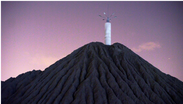
Still from Zhou Tao, "The Land of the Throat" (2016)

Zhou Tao's film "Land of the Throat" also shows violently remade landscapes, but in a poetic, futuristic tone. You sit in the bowl of a curved floor, with the two-channel film projected on either side. The room setup reflects the Pearl River Delta seen in Zhou's camera — abandoned industrial waste, manmade craters. He films them at night or dusk, capturing sleeping workers and animals scurrying around the sites. Shown in these quiet hours, the land is desolate, moonlike. You feel like an alien visitor watching a wasted earth.