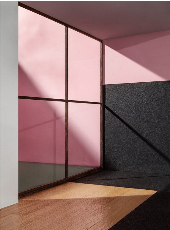
Reception Room, Casa Galvez, 2017