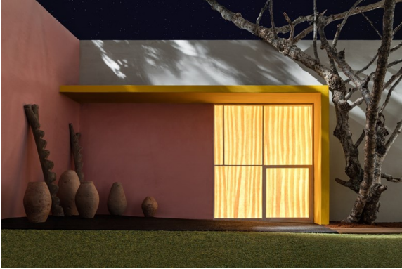
Yellow Overhang with Patio, Casa Galvez, 2016 © James Casebere, Courtesy Sean Kelly, New York

The resulting images invite the viewer to dive into a meditative space. It is difficult not to lose oneself in the composition of bright colours, warm light, and simplicity of design – all elements which work harmoniously together to create a kind of emotional respite. What better eye candy for a dreary Monday morning?