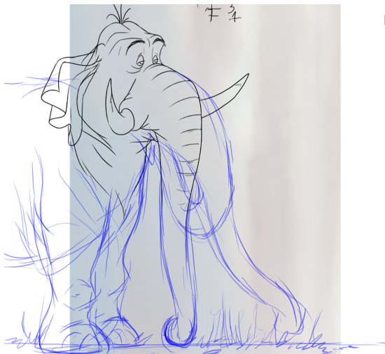
Die reine Notwendigkeit, 2016 Production images