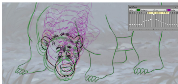
Die reine Notwendigkeit, 2016 Production images