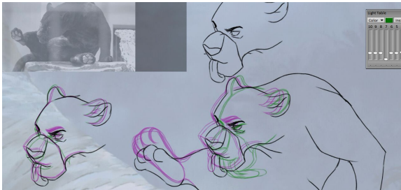
Die reine Notwendigkeit, 2016 Production images