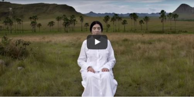
The Space In Between: Marina Abramovic in Brazil (Trailer)