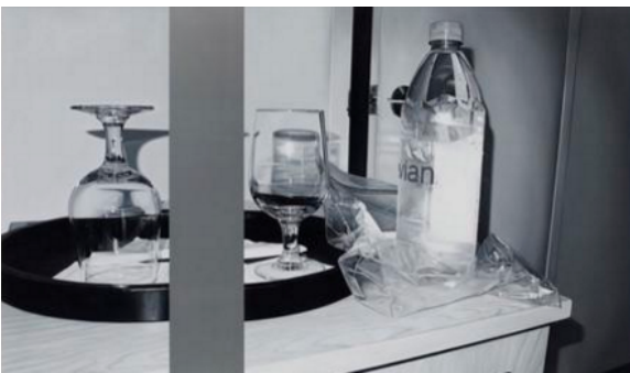
JAMES WHITE Aspect/Ratio #8, 2015 oil and varnish on aluminum panel in Perspex box frame painting