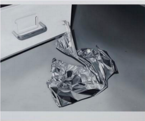
JAMES WHITE The Foil, 2015 oil on varnish on acrylic sheet in Perspex box painting