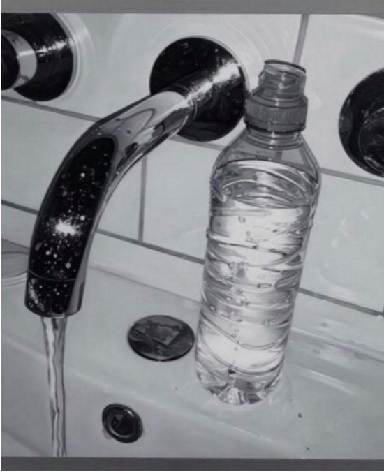
JAMES WHITE STILL #2, 2015 oil and varnish on acrylic sheet in Perspex box frame