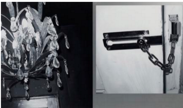
JAMES WHITE Aspect/Ratio #5, 2015 oil and varnish on aluminum panel in Perspex box frame painting