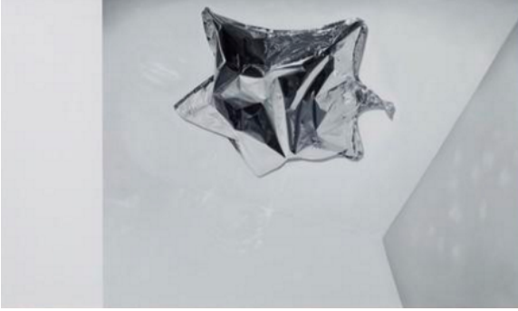
JAMES WHITE Aspect/Ratio #9, oil and varnish on acrylic sheet in Perspex box frame painting