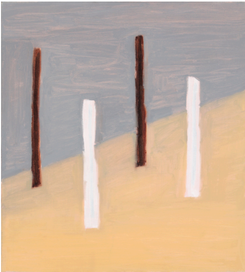
Ilse D'Hollander, Untitled , 1996. Oil on canvas. 23 5/8 x 21 1/4 in. ©The Estate of Ilse D'Hollander.