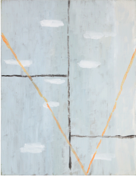
Ilse D'Hollander, Untitled , 1996. Oil on canvas. 28 x 21 5/8 in. ©The Estate of Ilse D'Hollander.