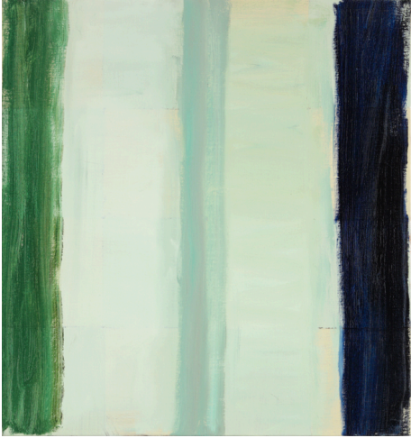
Ilse D'Hollander, Oostende , 1996. Oil on canvas. 20 x 18 1/2 in. ©The Estate of Ilse D'Hollander. Photo: Guy Braeckman, courtesy of Sean Kelly, New York.