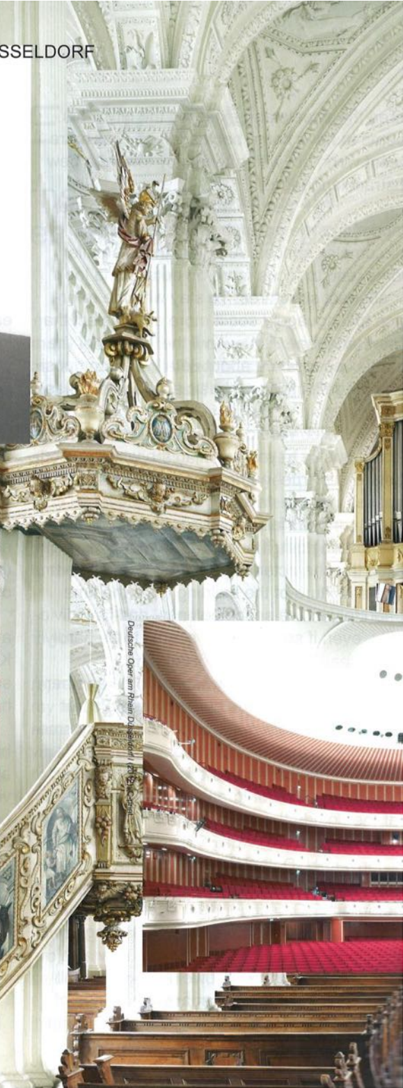
Deutsche Oper am Rhein Düsseldorf (2009); C-print.