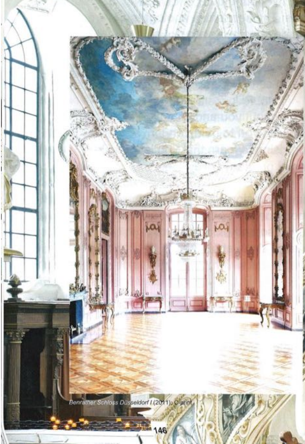
Benrather Schloss Düsseldorf I (2011); C-print.