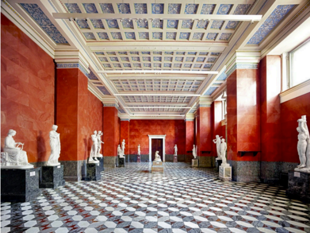
Candida Höfer Hermitage St. Petersburg VIII 2014, 2014 Ben Brown Fine Arts