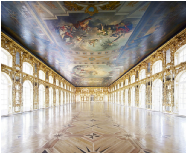
Candida Höfer Catherine Palace Pushkin St. Petersburg III 2014, 2014 Ben Brown Fine Arts

Those who didn't make it to the State Hermitage Museum in St. Petersburg, Russia, this past summer to see Candida Höfer's acclaimed series of photographs can now catch a selection of them at Ben Brown Fine Arts in London. The 10 large-scale C-prints of her "Memory" (2014) series show the splendid imperial halls of St. Petersburg with the hyper-precise detail that we've come to expect from Höfer's architectural images.