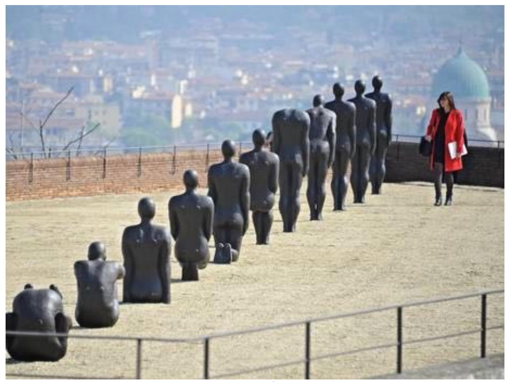
A woman looks at sculptures that are part of the exhibition 'Human' by British artist Antony Gormley at Forte di Belvedere in Florence, Italy. More than 100 scultures will be on display from 26 April to 27 September

For the new works, then, he did a 3-D scan of one of his body moulds, fed it into a computer to work out the size of the blocks and then stacked them, "like physical pixels", to make a standing figure. The result is something more cyborg-like than Gormley-like. "It's never been me!" he says, high-pitched. "I don't know what that means. When I see my work, I don't think, 'oh, I was looking good that day'. That's not the point. It's very, very simple, my rationale for using my own body... Why make another body when you've got one already? It would make sense if you were interested in representation," he sighs. "But I. Am. Not." He is interested in the body as a place, not a thing. In other words, they don't mean anything in and of themselves. "Exactly! They are floating signifiers."