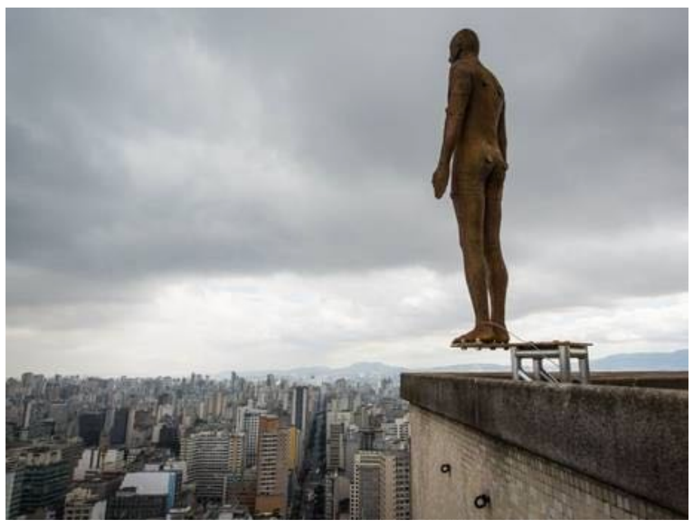
A sculpture by Antony Gormley in Sao Paulo, Brazil; the exhibition has been cancelled in Hong Kong after a banker's suicide