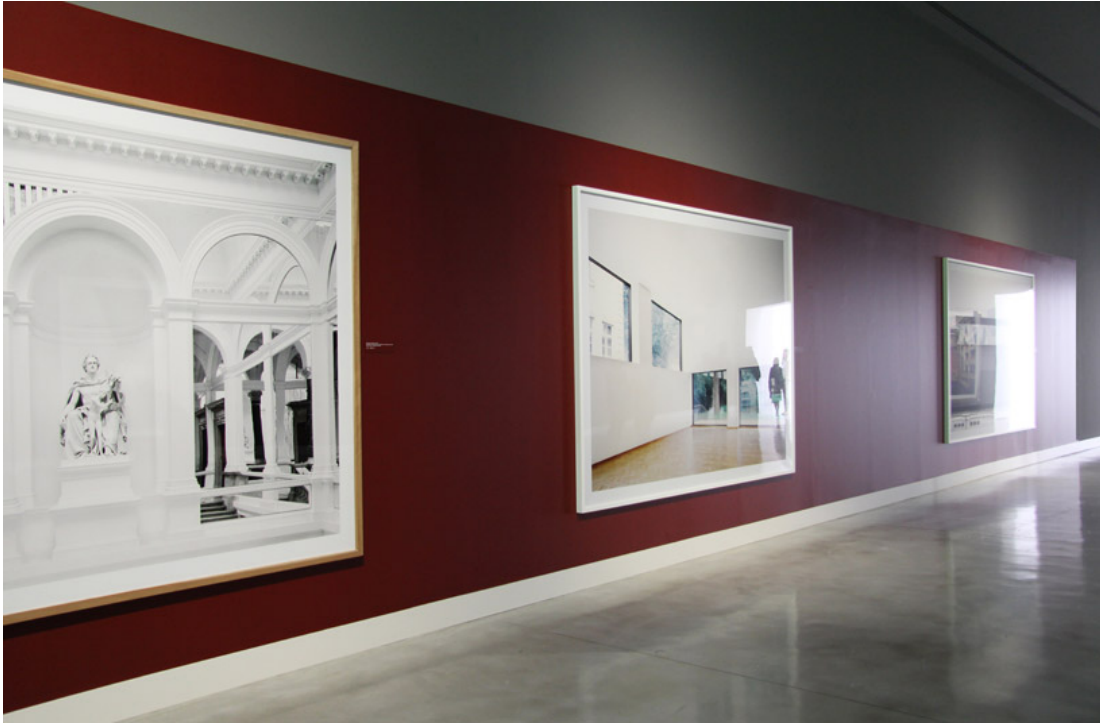
the large-format photographs line the walls of the vast gallery space