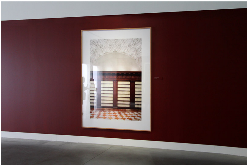
the photographs tower over the observer and allow them to see the details within at close range