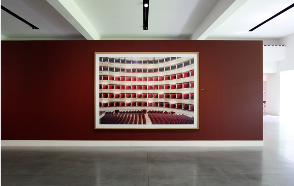
installation view of 'teatro alla scala milano III', 2005