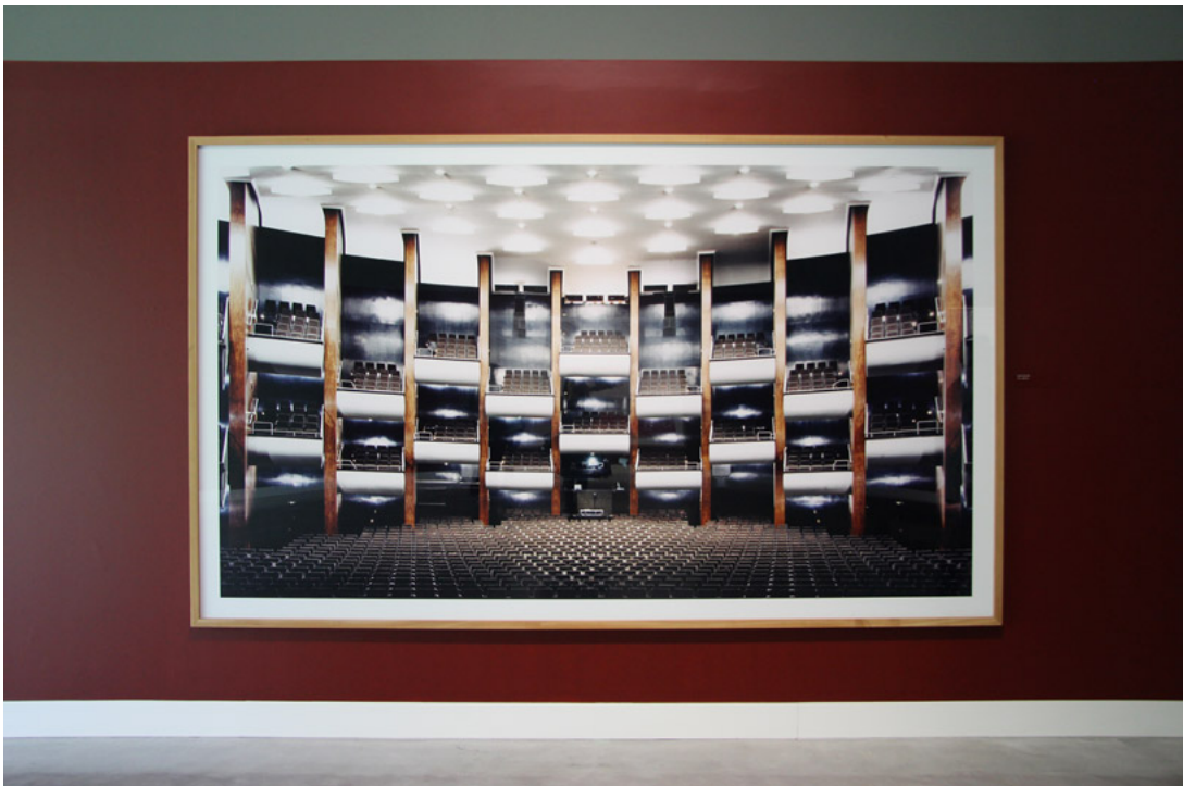
installation view at fondazione bisazza