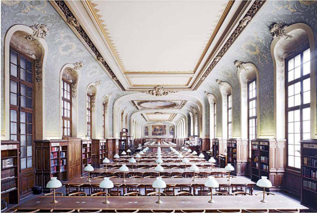
bibliothèque de la sorbonne paris I, 2007