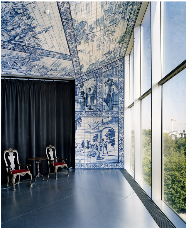
casa da musica porto IV, 2006 © candida höfer, köln; vg bild-kunst, bonn 2014