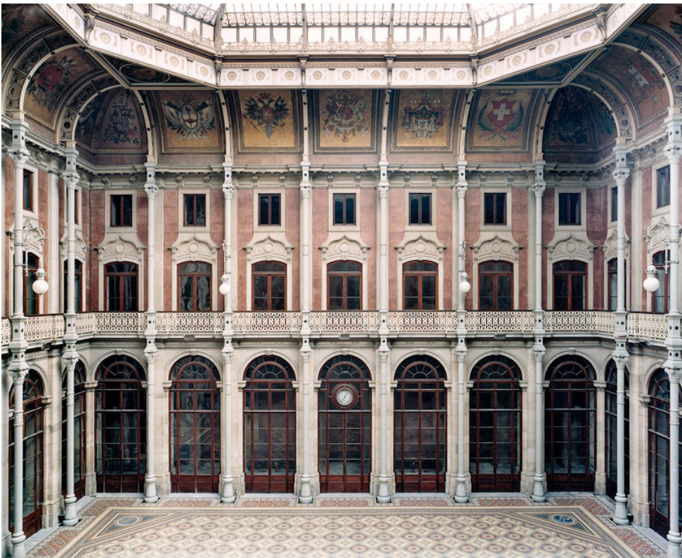
palácio da bolsa no porto II, 2006 © candida höfer, köln; vg bild-kunst, bonn 2014