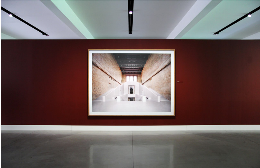
exhibition view of the photograph depicting architect david chipperfield's renovation of the neues museum in berlin

höfer's subject matter is always consistent: interior views of public spaces — museums, libraries, archives, theaters, offices, banks, and historic structures — all photographed with a straightforward vantage point, long exposure time and lit by the illumination source — whether natural or artificial — as the location was found. 'spaces are about light' höfer describes, 'that is why I photograph them in the light that I find in them' . perhaps the most compelling feature inherent within the works is actually the fundamental element they're all missing: a human presence. 'I prefer them when they are without people' she continues, 'spaces then seem to tell more about people, what they do for them and what people have been doing to them' . devoid of mankind, the images bear a silent yet emphatic tone, overwhelming their observer and drawing them closer, as if pulled by perspective into the scene.