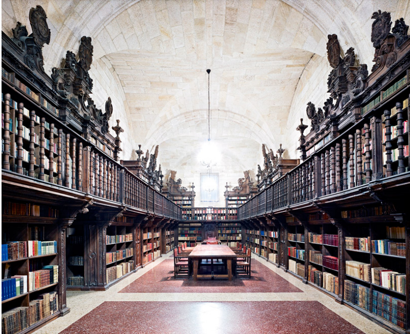
abadía cisterciense santa maría la real de oseira I, 2010

sharpness and clarity, without the employment of any kind of digital enhancement. intricacies and complexities hidden within the scene are brought forth for the viewer to survey at close range , transforming the structural components of the buildings, and the everyday objects placed inside them, into abstract geometries and patterns that seem to be the hand-rendered brushstrokes of a master painter.