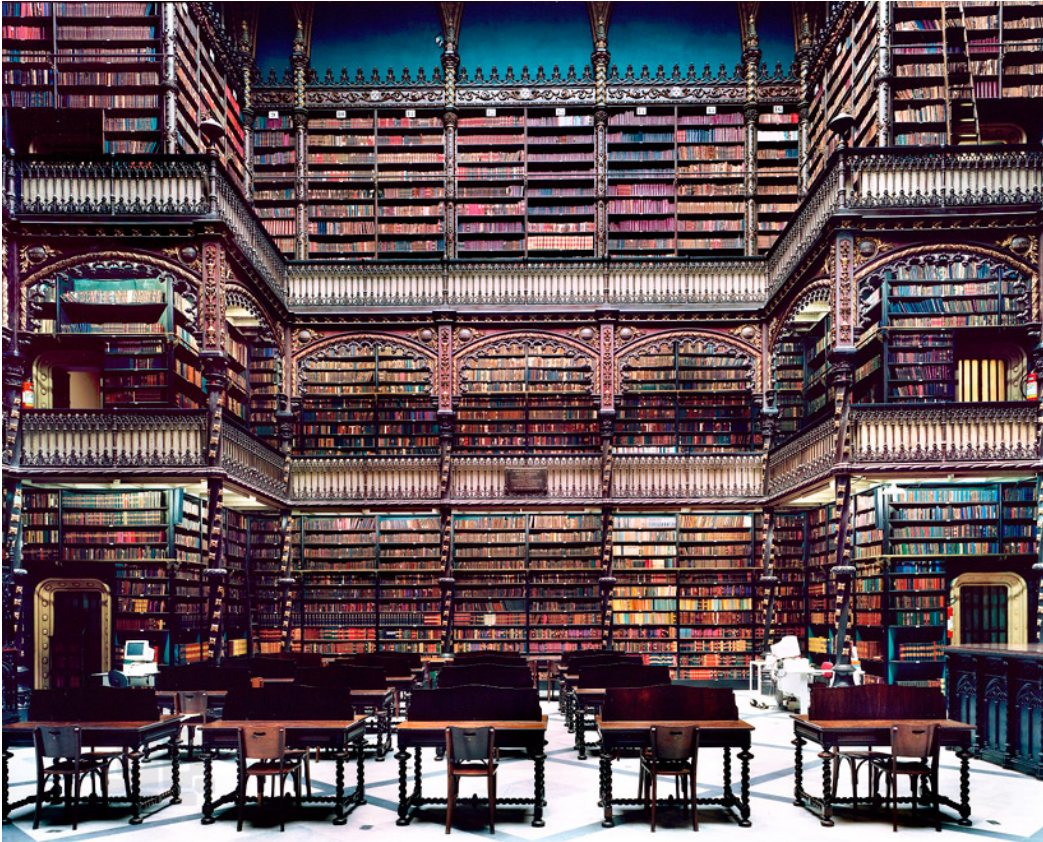
real gabinete portgues de leitura rio de janeiro IV, 2005