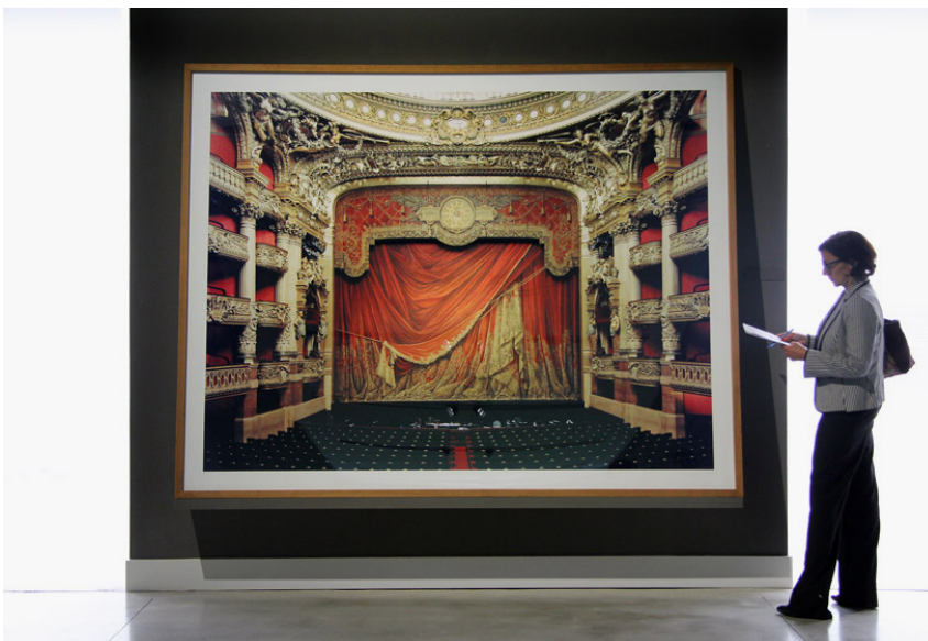
exhibition view of 'palais garnier paris XXX', 2005 at the fondazione bisazza

höfer's subject matter is always consistent: interior views of public spaces — museums, libraries, archives, theaters, offices, banks, and historic structures — all photographed with a straightforward vantage point, long exposure time and lit by the illumination source — whether natural or artificial — as the location was found. 'spaces are about light' höfer describes, 'that is why I photograph them in the light that I find in them' . perhaps the most compelling feature inherent within the works is actually the fundamental element they're all missing: a human presence. 'I prefer them when they are without people' she continues, 'spaces then seem to tell more about people, what they do for them and what people have been doing to them' . devoid of mankind, the images bear a silent yet emphatic tone, overwhelming their observer and drawing them closer, as if pulled by perspective into the scene.