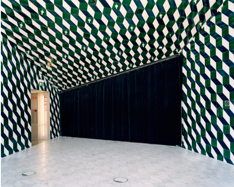
casa da musica porto I, 2006 © candida höfer, köln; vg bild-kunst, bonn 2014