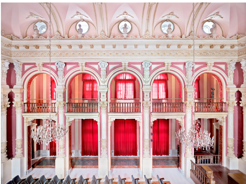
IES otero pedrayo ourense II, 2010 © candida höfer, köln; vg bild-kunst, bonn 2014

nearly-endless rows of aged book covers at the real gabinete portugues de leitura in rio de janeiro seamlessly synthesize into an ornate motif; closely-packed brick work at the neues museum in berlin forms a labyrinthine depth; creases of light shining through the apertures at the biblioteca dei girolamini in naples radiate with an almost illustrated glow. höfer's practice relays the story of each place, offering the viewer the opportunity to establish an exclusive and rare relationship with these temples of knowledge and houses of history.