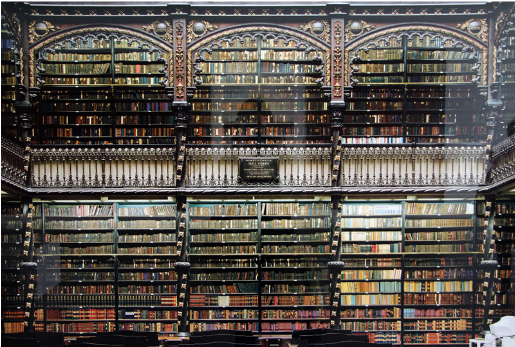
detail of 'real gabinete portgues de leitura rio de janeiro IV' image © designboom