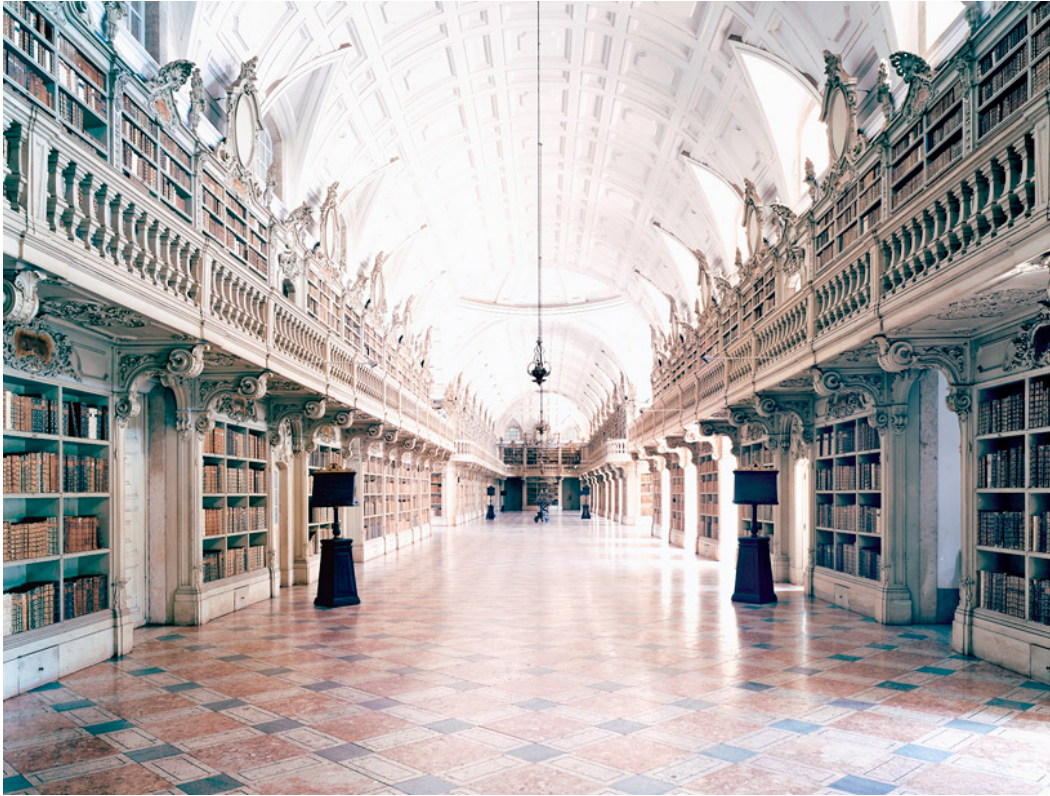
biblioteca do palácio e convento de mafra I, 2006 © candida höfer, köln; vg bild-kunst, bonn 2014