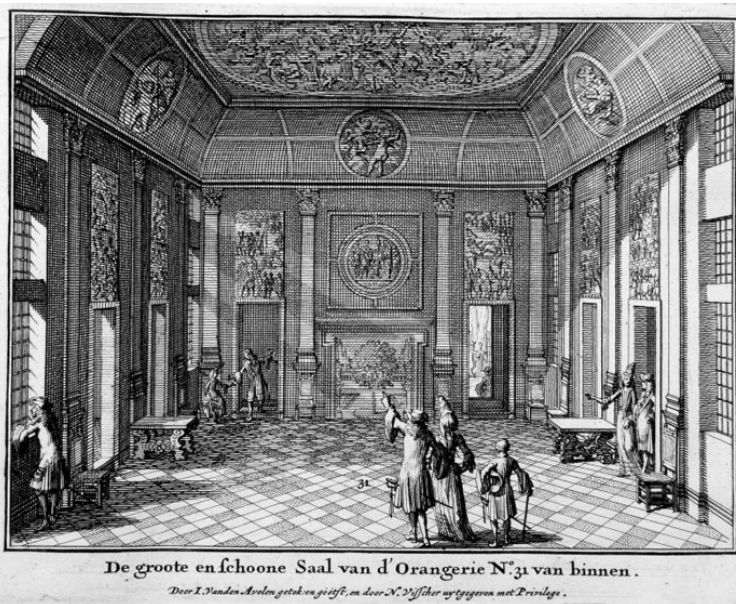
Jan van den Aveelen, view of the Orangerie at Sorgvliet, published by Nicolas Visscher, Amsterdam, 1697(?)

These two aspects of Höfer's work, the formally unified series and the emptiness of the rooms, differentiate her photographs from other straight-on perspective views. The technique has been a common means of representing interiors since the seventeenth century, when it often appeared in topographical prints. Engravings like Jan van den Aveelen's View of the Orangerie at Sorgvliet (1697) or David Loggan's View of the Bodleian Library at Oxford (1675) feature the same balanced recession into space, focus on the rear wall, and exhaustive detail as Höfer's photographs, but they include human figures that give each room a scale. As in Höfer's work, the seventeenth-century prints were produced as parts of larger series devoted to particular places (Oxford University and the gardens of Sorgvliet, respectively), but in those series, the interior perspectives were published alongside plans, elevations, and bird's-eye views. The location itself remains the primary focus of both the single print and the series as a whole; each image is composed to foreground the architecture. Höfer's photographs, however, also use architecture to foreground the composition of the image.