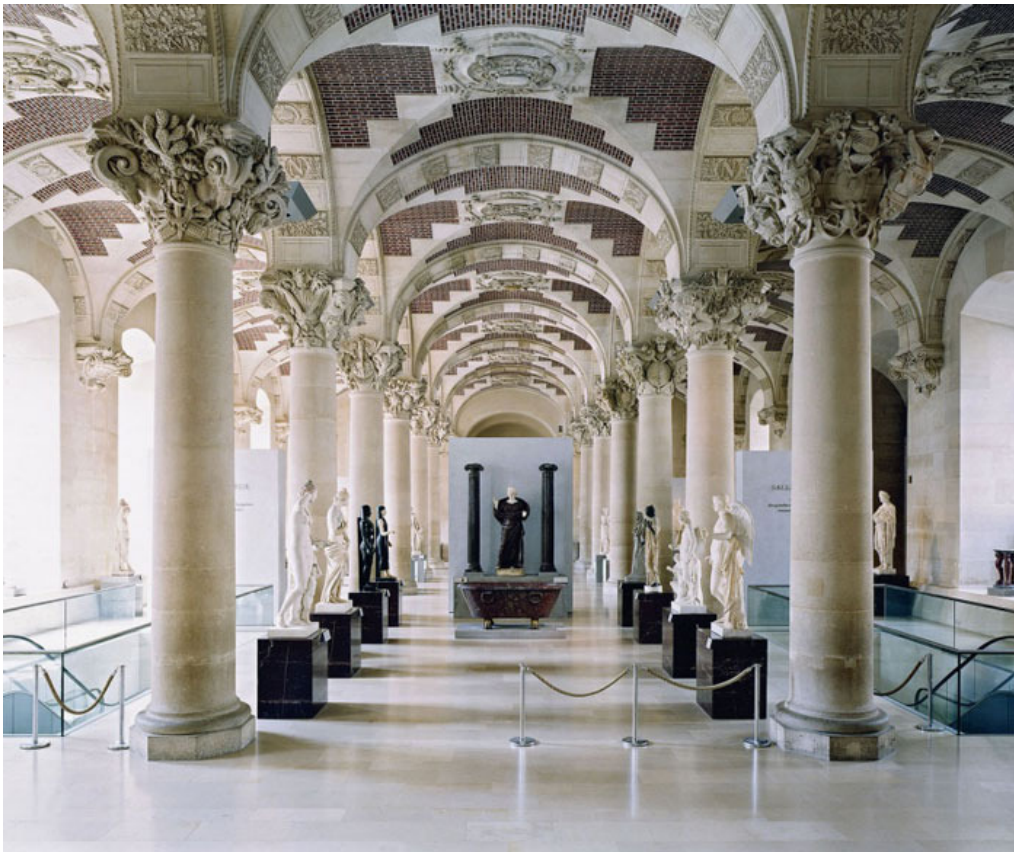
candida höfer, musee du louvre Paris IX, 2005, c-print

Candida Höfer's photographs of interiors of public buildings have nobody in them but seem portrait-like nonetheless. As in her recent show at Sonnabend Gallery, "Florence and Naples," she titles her pieces after her "sitters," with names referring to institutions such as libraries and galleries rather than people. She tends to shoot each actionless room from an elevated vantage point near one wall so that the far wall is centered within the resulting image; instead of receding into space, the far walls, with such a framing device, seem to project forward toward the viewer. Background spaces become primary subjects.