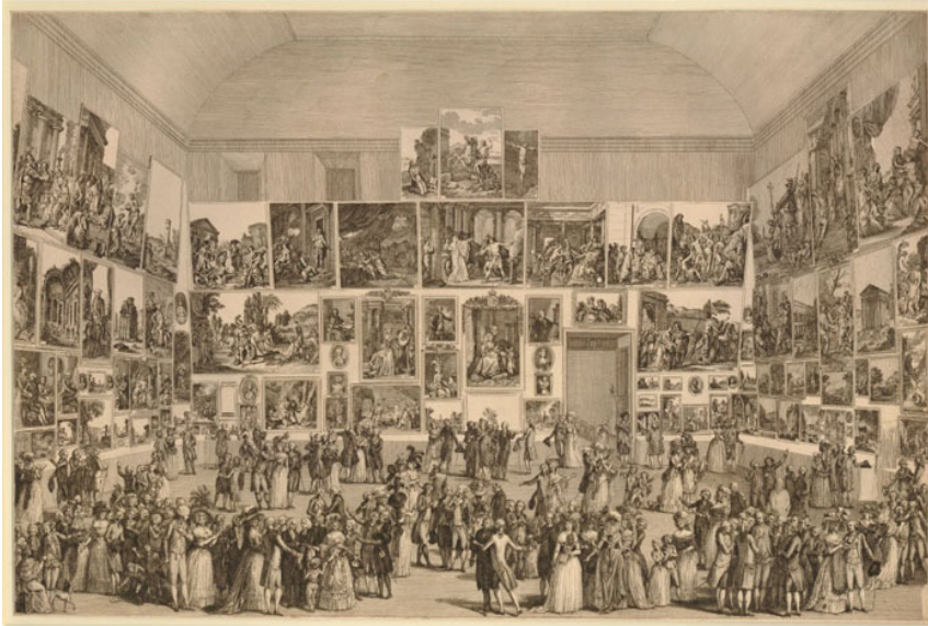
pierre antoine martini, exposition au salon du louvre en 1787

the photograph replaces the fourth wall of the gallery, parallel to and analogous with the wall at the opposite side. Made two centuries earlier, Pierre Antoine Martini's etching Exposition au Salon du Louvre en 1787 is structured the same way but to a different effect, as the spectators supply a scale to the piece and simultaneously destroy its illusion. By emphasizing their own physicality, Höfer's photographs give virtual heft to a weightless medium. In many ways a portraitist, in this sense, at least, she is an architectural photographer.