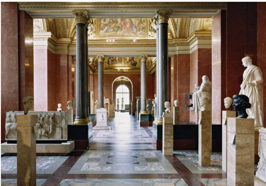
candida höfer, musee du louvre paris vii, 2005, c-print

HÖFER: I have gotten used to it. The Bechers' teaching—or rather the conversations we had, because their style was conversational—did not press us into any school. And we have all been different from the beginning. So there was no need for a conscious effort to free ourselves. I assume it is more retrospectively that this school perception seemed to have evolved. We simply enjoyed being together at a specific place, at a specific time when photography as art was no concern for us because it was self-evident.