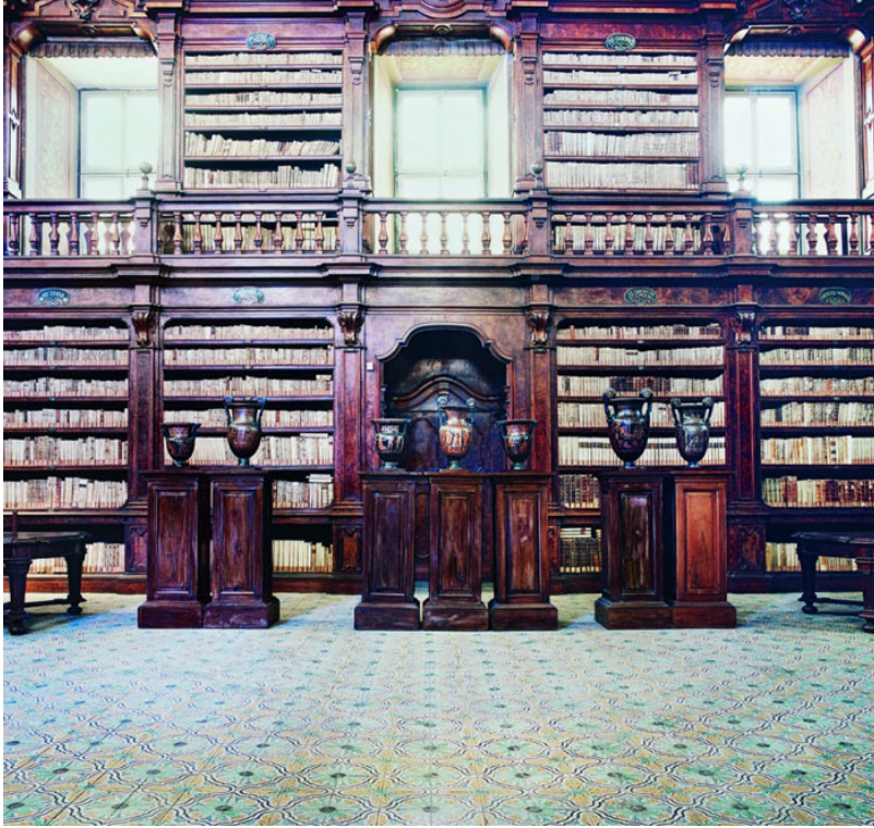
candida höfer, biblioteca dei girolamini napoli iv, 2009, c-print

Yerkes : Further to this point, the imperfections in the scenes you choose to depict are rendered more evident in contrast to the technical perfection with which you depict them. Can you describe your interest in this contrast?