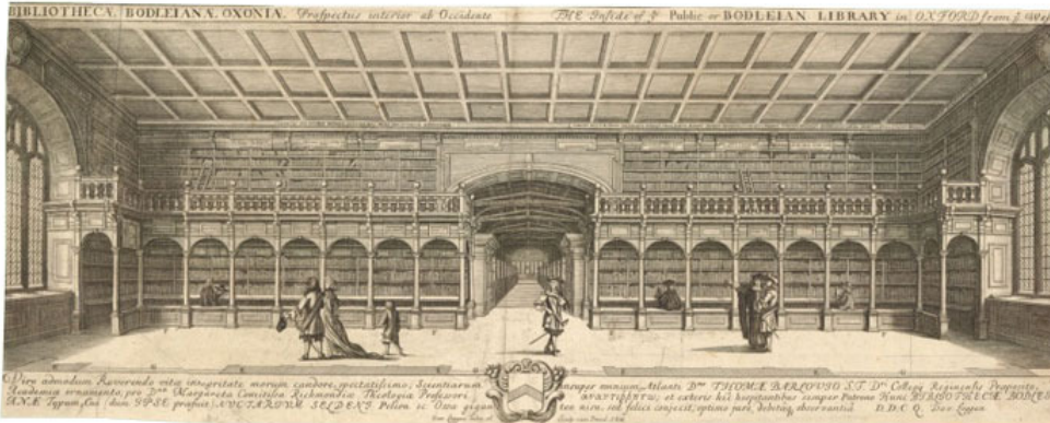
David Loggan, view of the Bodleian Library at Oxford, published in Oxonia Illustrata , Oxford, 1675, © Trustees of the British Museum