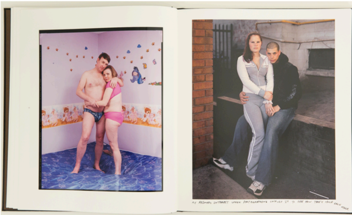
“My primary interest when photographing couples is to see how they hold each other.”