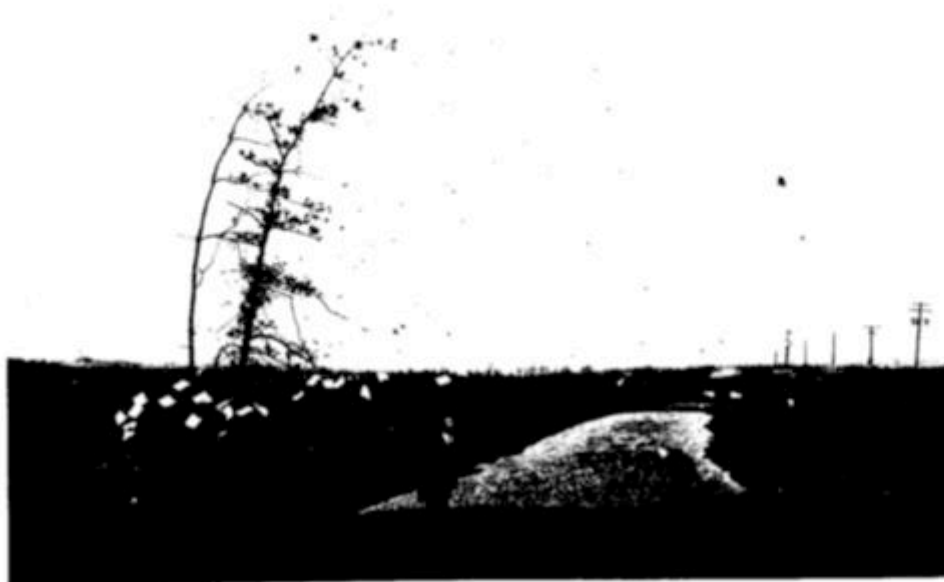
Fig. 3.2 Jeff Wall, A Sudden Gust of Wind (after Hokusai) 1993. Transparent in lightbox, 229 x cm. Courtesy of the artist and the Cer Contemporary Art.

Jeff Wall's A Sudden Gust of Wind (After Hokusai) (1993) (fig. 3.2) famously takes the same motif—the wind that blows all the land surveyor's papers and his hat up into the air—a spiraling moment of chaos, loss, and disorder frozen into the stilled durational field of the tableau. This photograph was made in the tradition of Rejlander's combination print and involved the combining of several different images into one seamless whole. What is also clear is the way in which Wall uses this carefully constructed composition to play with the relationship between the flattened staging of the tableau of figures in the foreground and the receding landscape of modernity that is always the true subject of Wall's pictures, that lies behind them. Our own gaze, in this moment of non-time, follows that of the central figure up to the lost hat sailing overhead, the clarity of whose reproduction belies the naturalism of the photograph as a whole.