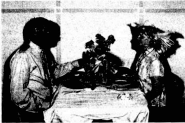
Michael Snow, 20:49, 15/6/2001 Laminated photograph on film, 122x183 cm. Property of the artist.

part of the spectator, a desire which may itself tell us something about the fragility of modernity's relationship to time.