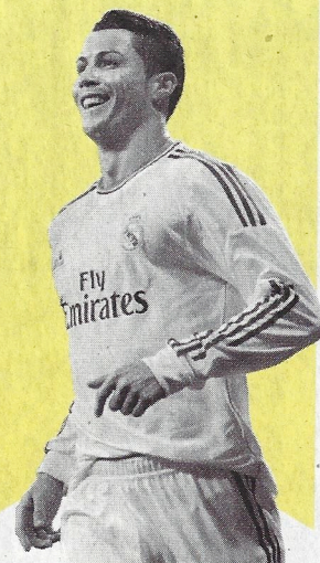
ABRAMOVIC: RONALDO

Pelé won three World Cups as a member of the Brazilian team