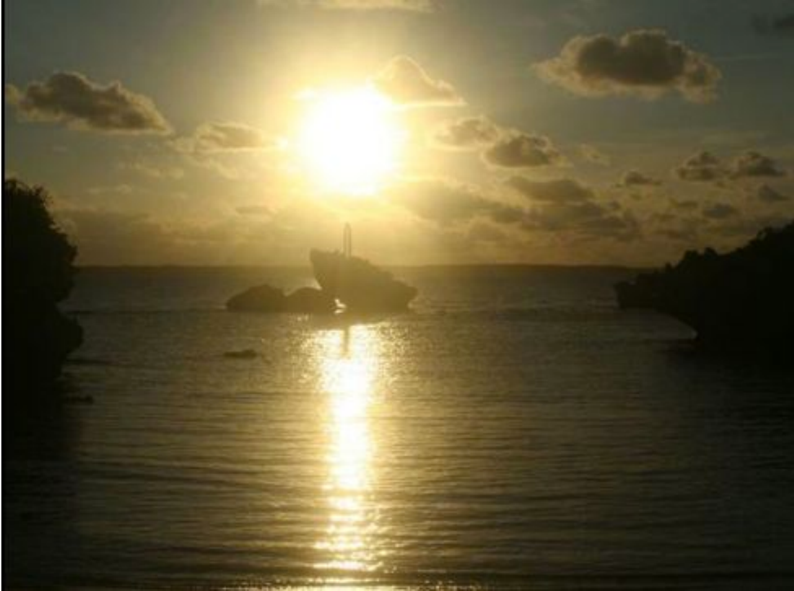
Mariko Mori: 'Sun Pillar' (2011) Mariko Mori