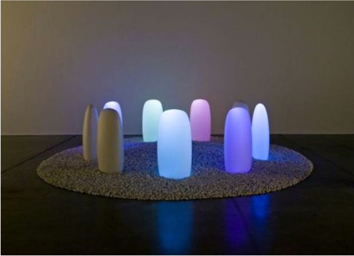
Mariko Mori: 'Transcircle' (2004), Mariko Mori