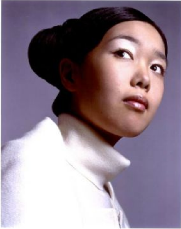
Mariko Mori David Sims