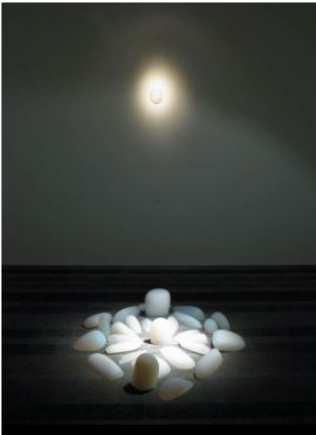
Mariko Mori: 'Primal Memory' (2004) Mariko Mori