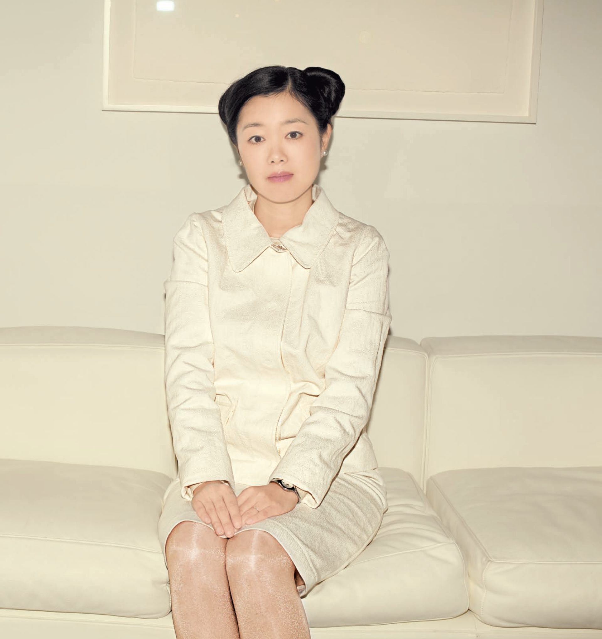
Mariko Mori in her New York studio, 2011.