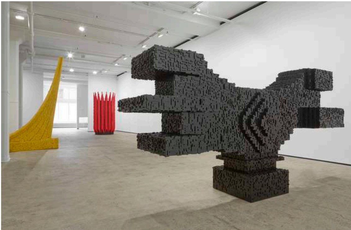
Photo © Los Carpinteros / courtesy Sean Kelly Gallery Installation view of the Los Carpinteros exhibition, Irreversible , at Sean Kelly Gallery in New York. The show runs through June 22. SLIDE SHOW

On Saturday, the Cuban art duo Los Carpinteros (“The Carpenters”) opened an exhibition of new work titled Irreversible . It should be called Irreverent .