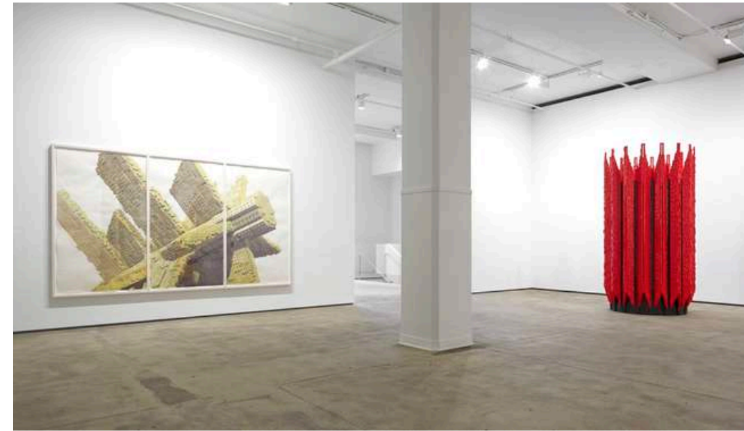
Installation view of the Los Carpinteros exhibition, Irreversible , at Sean Kelly Gallery

"The conga is an amazing tool to bring people together," says Castillo. "The Cuban Revolution used conga as a political rhythm; if you couldn't keep up, you were not a