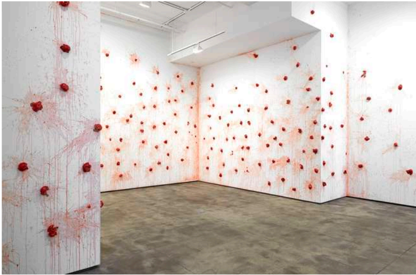
Photo by Jason Wyche / © Los Carpinteros / courtesy Sean Kelly Gallery

Detail from Los Carpinteros, Tomatoes , 2013